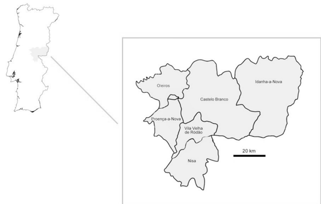
Figure 1: Location and composition of the geopark's territory

Note: Due to the recent rearrangement of the territory with Penamacor's municipality new entry (September 2015), the map does not include this new area. Penamacor municipality is located on the north of Idanha-a-Nova municipality