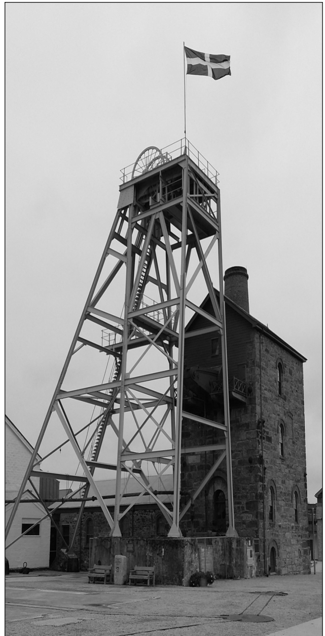
Fig. 3 Saint Piran's flag flying on top of Robison mine shaft.

SUBMITTED: OCT 2017 REVISION SUBMITTED: JAN 2018 ACCEPTED: FEB 2018 REFEREED ANONYMOUSLY