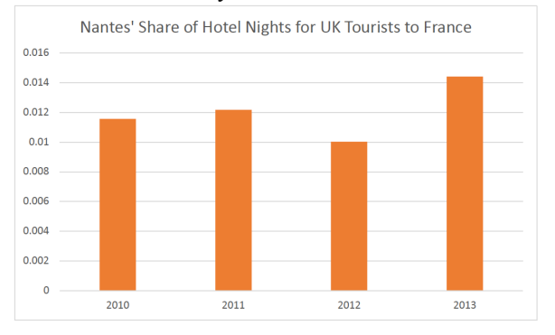
Figure 3 Nantes' Share of the Hotel Stays for Inbound UK Tourists to France; plotted using data from LVAN (2016)

does again show as an increase in Nantes' share of UK visitors. At the time of writing, no more recent figures had been released for the years 2014-2016.