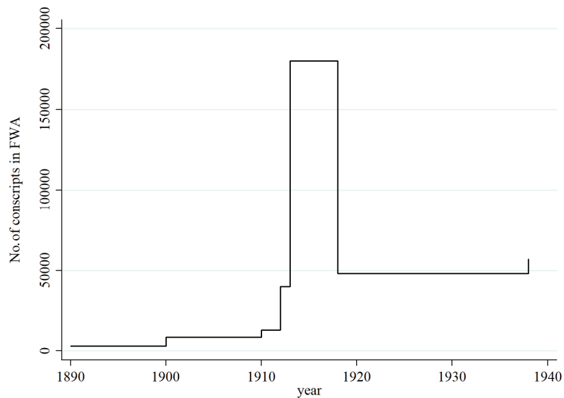
Figure 1: Recruitment in French West Africa from 1890 until 1939