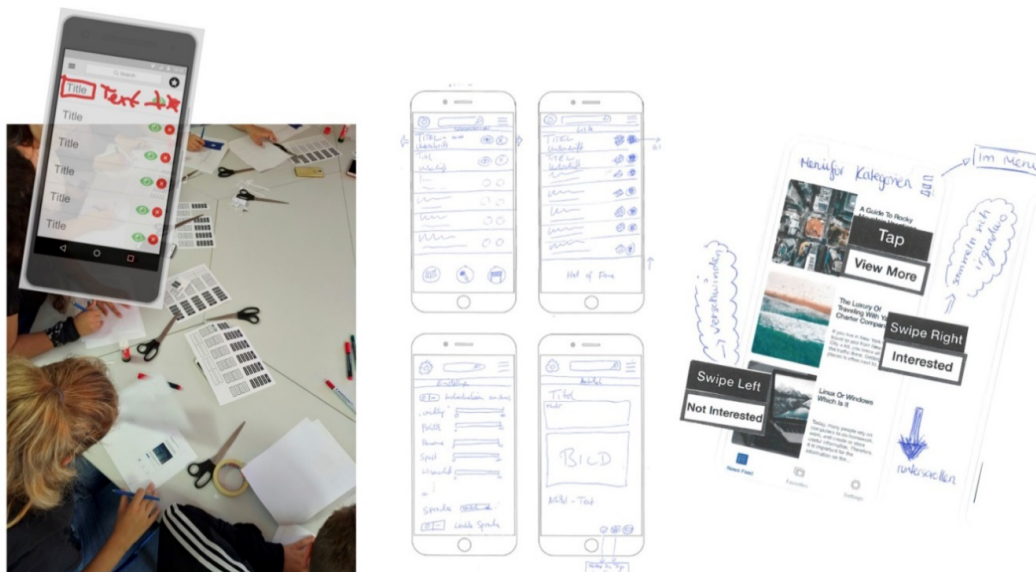
Figure 1. Example of a co-creation workshop.

‘developers’ and ‘users’ but it does make it possible to ease the rigid boundary between them. That said, across the workshops the focus on the prototype as a relational boundary object turned out to be central: Its iterative development has connected the sequence of the different workshops in a meaningful way and it also offered the participants in their practical work an orientation within each respective workshop particularly in regard to its position in the development process as a whole. The practical work with paper, pen, and scissors was used to playfully visualize ideas. This provided opportunities to stimulate the “practical consciousness” (Giddens, 1984, pp. 41–45) of the workshop participants: On the practical level of their ‘everyday doing’ they ‘know’ how they would (like to) act with such a news platform, while ‘discursively,’ for example, in an interview or by means