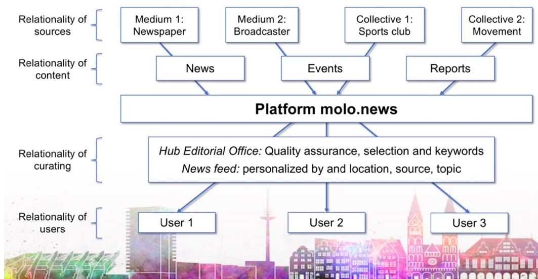
Figure 2. Molo.news as a relational platform.

So, what forms does the prototype that was developed in this co-creative process take? In essence, the platform we developed is characterized by the fact that it establishes a kind of fourfold relationality. Each distinct aspect of relationality operates at the level of sources (providers of content), of content, of curating, and of users (see Figure 2). We thereby associate a shift from the con-