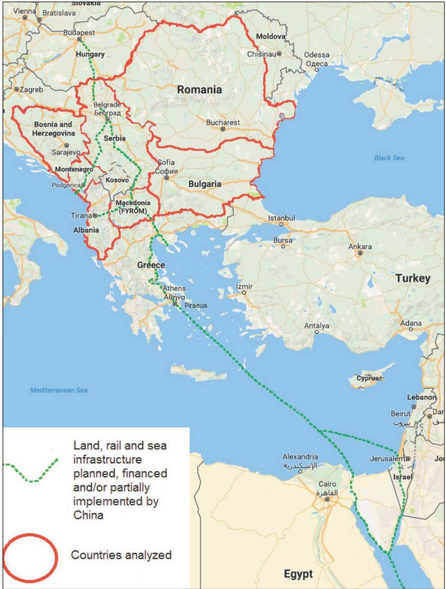
Fig. 5: The 21 st Century Maritime Silk Road (MSR)-Corridor (Mediterranean section: Suez-Canal-Piraeus-Belgrade-Budapest) of China's Belt and Road Initiative (BRI)