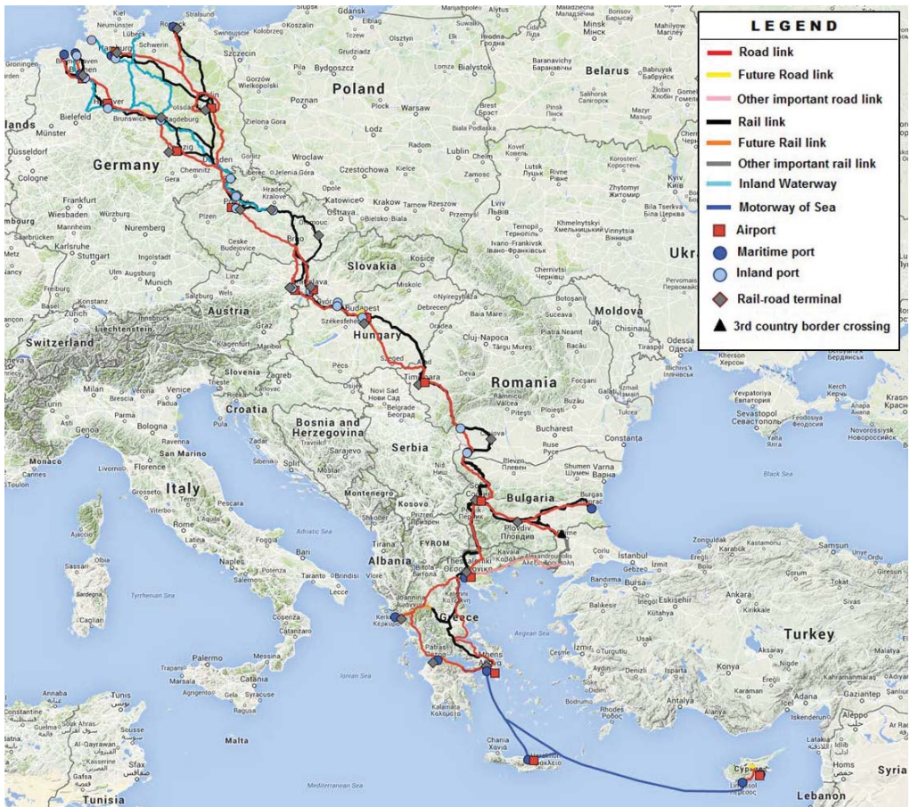
Fig.1: The OEM TEN-T Core Network Corridor, alignment and nodes

original designation as one of the priority projects, and then the modification in 2012 under the name Orient/East-Med (OEM) Corridor (Corridor No. 3 of the nine TEN-T core network corridors).