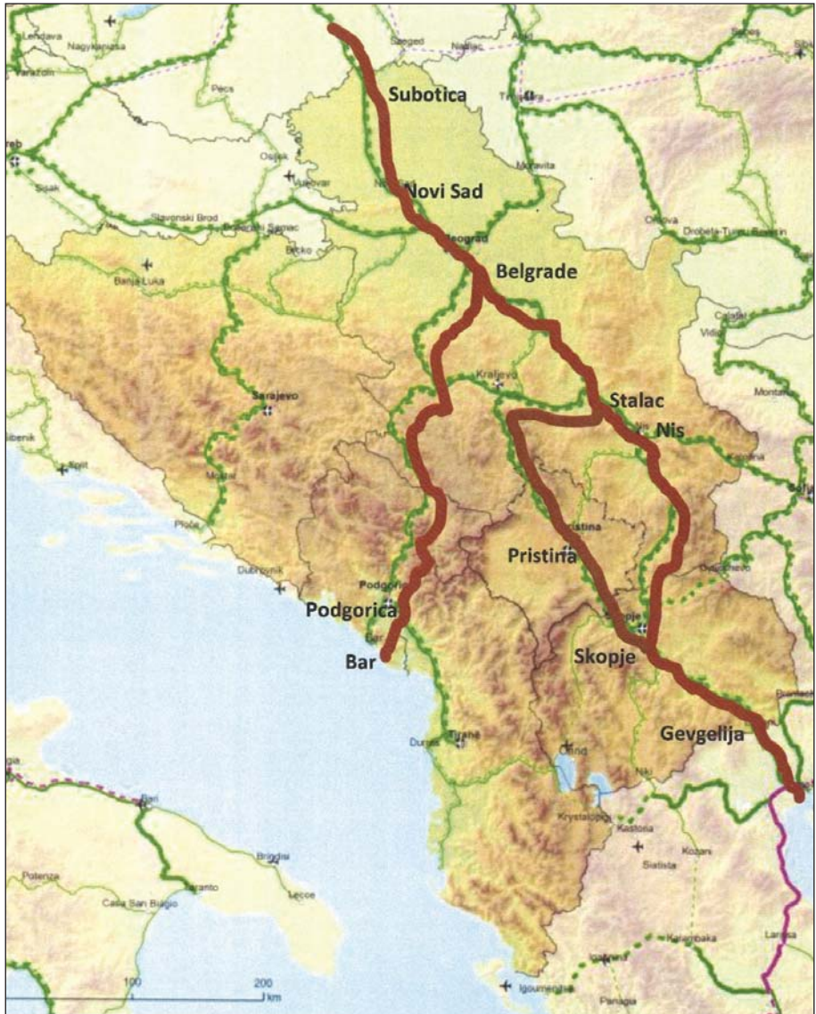
Fig. 4: Alignment of the OEM Corridor related to the Western Balkans core network (Rail)