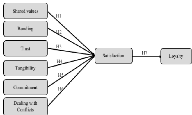
Figure 1. Research Framework

From Figure (1), the developed hypotheses could be stated as follows: Customer satisfaction is positively affected by shared values (H1), bonding (H2), trust (H3), tangibility (H4), commitment (H5), and handling conflicts (H6). Meanwhile, customer loyalty is positively influenced by customer satisfaction (H7).