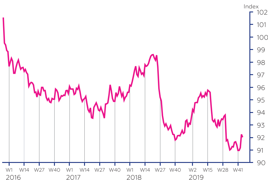
Figure 1: The People's Bank of China is Undertaking a Slow, Managed Depreciation

The use of such alternative barriers could intensify the trade conflict in the currency realm, inevitably forcing countries with the highest potential for currency appreciation to shoulder a greater part of the burden of the adjustment between the US and China. The tacit Sino-American agreement of 2015 had contributed to the policing of exchange rate volatility and capital flows. If China decides to make the trade confrontation monetary, it will first and foremost affect those surplus countries – such as Japan and the euro area – which had been most enjoying its indirect benefits. In addition, US adjustment efforts to weaken the USD might well increase if President Trump weighs in himself, intensifying pressure on the Federal Reserve – perhaps