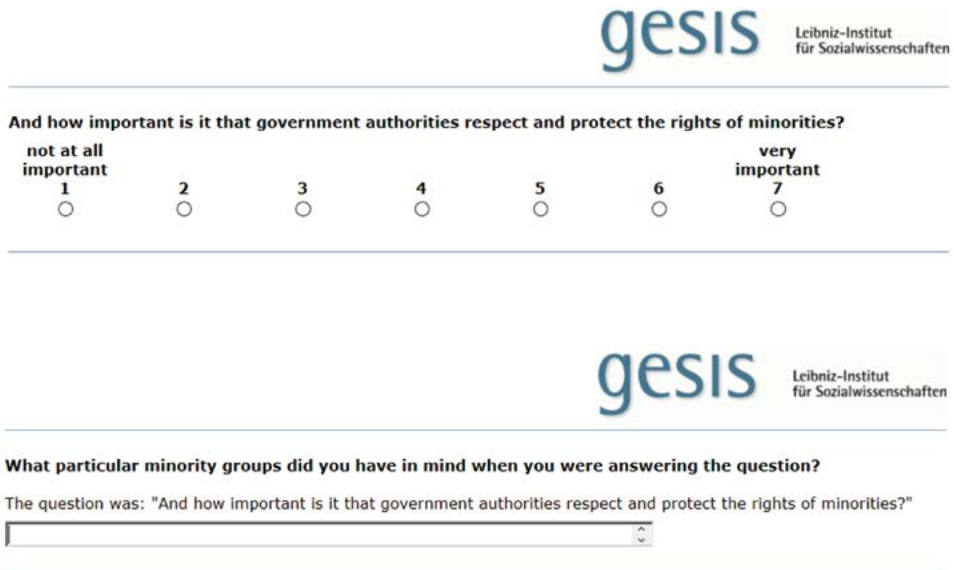
Figure 1. Closed ISSP item and probing question in the web survey