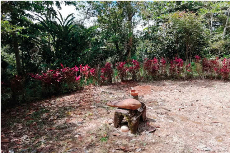
Fig. 1. The ritual circle and “ kata ” the stone of fertilization.

conceived as a plant of male's virility and manioc as a plant of female's fertility whose power must be assimilated by men and women not only for their biological reproduction, but also for the emphasizing of their gender roles that foster the sociocultural continuity and division of labour of this society.