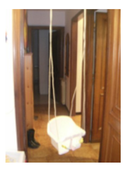
Figure 4: Family D, the kitchen door as a place for a swing

Other families offered further examples. In particular, Family D transformed the jamb of the kitchen door into a place for the children's swing (see Fig. 4), while Family E organized the bedroom as a multipurpose space, transforming the bed into a sofa and leaving an empty space in the middle of the room (see Fig. 5). These are examples of families' ways of redefining the internal boundaries of rooms, moving back and forth between private areas during the night (e.g., the parents' bedroom) and common family areas during the day.