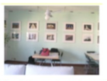
Linearity in common space's organization

Another aspect emerging from the composite design of our investigation concerns the participants' design and use of spaces as a way to present personal discourses regarding the family. More particularly, we observed different configurations of common rooms: for example, spaces were presented in terms of linearity versus cumulative places, according to the family history and development (see Fig. 8). This is especially clear in living rooms, in which a large number of objects (decorations, books, photos) are displayed by family members (see Fig. 9). These photos represent not only individual or family styles, but also functional ways to use the space, to show a sense of style and to account for the organization of activities connected to specific objects.