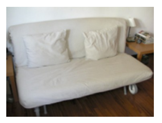
Figure 5: Family E, the parents' bedroom; a foldaway bed becoming a sofa [32]

These examples show how families are constantly reframing the demarcation of external and internal spaces, especially within small flats in which a reorganization could be essential for using limited spaces for more than one activity. Referring to the methodological design we used, it seems to us that these aspects are related to a dynamic use of spaces and objects that was possible to capture by combining different sources of information. In our view, the design was settled in a useful way to detect the "lives" of objects and spaces, instead of representing a static picture of home areas, as it is case of data sets constituted exclusively by photos or answers to questionnaires or interviews. [33]