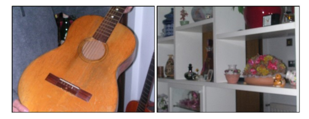
Figure 6: Family G, the display case holding the mother's collection of objects and the father's guitar [38]

Excerpt 5: "Displaying personal objects." Family G, mother's video-tour. Participant: mother (46 years old)