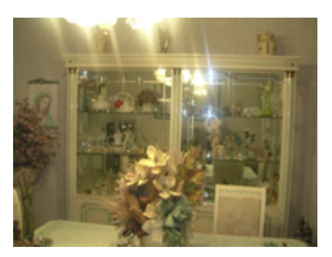
Figure 9: Family F; the living room [41]

Figure 8: Family C (left side) and Family E (right side): living rooms