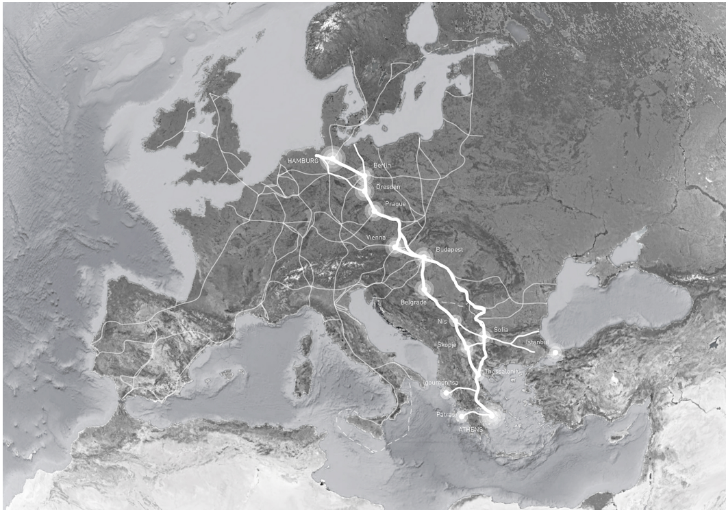
Fig. 1: The Orient/East-Med Corridor including the Western Balkans transit route.

The corridor leading from Hamburg to Athens, previously defined as the infrastructure project no. 22 in the European Union (EU) TEN-T (Trans-European Transport Network) policy, and as the TEN-T Orient/East-Med(iterranean) (OEM) Corridor as part of the more recent EU Core Network, is a key cross-European transport corridor, for which the programme "Connecting Europe Facility" allocates funds for infrastructure development. Over its length of more than 2,500 km, it has the capacity to directly connect various ports in Europe: from the ports in northern Germany (e.g. Hamburg and Rostock), across the Danube ports (e.g. Vienna), to the Mediterranean seaports (e.g. Thessaloniki and Athens). Furthermore, as it directly intersects the Danube River, the ports of the Black sea are also easily approachable via the OEM Corridor. In addition, via railway branch lines, the corridor is also connected to the Adriatic ports (e.g. Koper and Rijeka).