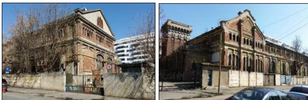
Figure 12 and 13. The building of the first power plant in Bucharest

Bucharest's first power plant. On the other side of Carol Park, on the General Canadiano Popescu street, close to the old Filaret train station and opposite of the Dimitrie Leonida Technical Museum, lies Bucharest's first power plant (Figure 12, Figure 13). Which keeps its authentic architecture with arches at the frontons and imposing architectural details. The combination of the bricks with the masonry (Dușoiu, 2014), which are easy to see from the outside as well, combined with the iron in the upper part of the interior and with the imposing presence of the two water towers, transform this building into a true industrial fortress with a very high degree of architectural attractiveness. The building is in excellent condition, considering it's over a century old.