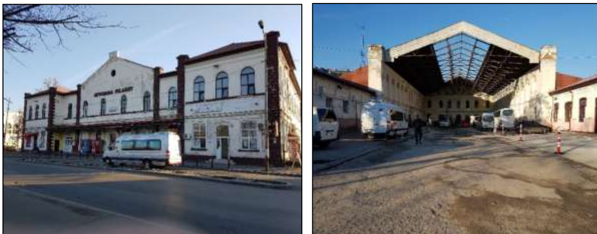
Figure 9 and 10. Filaret Train Station, currently the Filaret Bus Station

Around this train station multiple industrial complexes have been built because of the proximity to it which could provide them with resources for production. Currently, through renovations and assigning touristic functions, this area could bring back a part of the city's mood during that time, when this area was strongly industrialized.