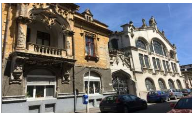
Figure 20. The home (left) and the carriage factory (right) of H. I. Rieber

The building in the neo-gothic style with moorish and byzantine influences, looks more like a palace rather than a simple carriage factory from the beginning of the 20th century (Figure 20). Attached to this factory is the home of its owner to its left, the home is also in a neo-gothic style, which makes this small ensemble even more unique, which is only enhanced upon by the fact that it's the only factory in a neo-gothic style in the country.