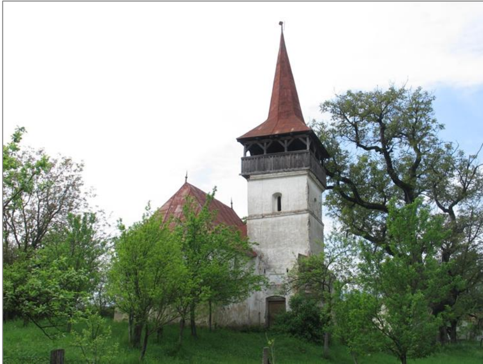
Figure 5. The protestant church from Peșteana (Cepraga, May 2014)

The beginning of the 18th century coincides with the creation of the Greek-Catholic Church in Transylvania. This institution was formed in order to represent both the interests of the Habsburg monarchy, which supported the catholic population, and the interests of the Romanians who were devoted to the Orthodox Church. Throughout the next two centuries, vicars and bishops of the Greek-Catholic Church surveyed Țara Hațegului in order to investigate the state of conservation of the churches and the existence of parochial houses and schools (Vulea 2009).