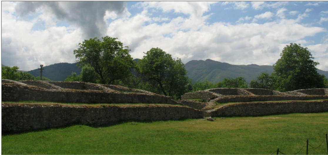
Figure 2. The ruins of the Roman amphitheatre from Sarmizegetusa, Țara Hațegului (Cepraga, May 2013)

Another target of the newly erected Roman capital was to powerfully contrast the old capital from which it took the name. By locating the city at no more than several kilometres from the Dacian capital, the Romans assured the perfect way of asserting the power by offering a clear contrast between the old and the new city.