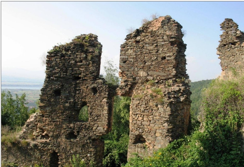
Figure 3. The ruins of Colț Fortress (Cepraga, August 2014)

Its example was immediately followed by the most influential noble families from Țara Hațegului. In the following centuries several other strongholds were attested. The most famous is Colț Fortress which was built by the Kendeffy family at the end of the 14th century (Popa 1988) (Figure 3). The stronghold is located on a ragged mountain cliff, just above the southernmost village from the valley. Its original purpose is not precisely known, but historians believe that it was probably a refuge and a good observation point of the family's possessions. The considerable size of the fortress matched the wealth and the influence of the Kendeffys and could have been used as a symbol of their regional power.