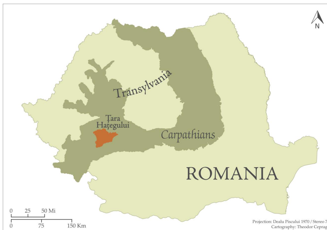
Figure 1. Location of Țara Hațegului within Romania

The study area is located in the south-western part of Transylvania, overlapping the second largest depression from the Romanian Carpathians, called the Hațeg Depression (Figure 1). In the geographical, historical and ethnographical literature this area bears the name of Țara Hațegului (Popa 1999; Popa 1988; Vuia 1926). All the regions from Romania which are denominated with the word țară raise difficulties in establishing their boundaries. The word has several meanings in the Romanian language. It may refer to the country, as a whole, but more often to some regions located in the Carpathian depressions (Oancea 1979) Ion Conea (1963) argued that the word țară was used to indicate the agrarian regions of the whole country as opposed to the mountains. The word also appears in many historical documents where it has the meaning of political structure ruled by local nobleman (Oancea 1979). Therefore, Țara Hațegului comprises both the lowland region of the depression used for agriculture and the surrounding mountains which are playing a vital role in its local economy (Vuia 1926). The limit proposed by Nicolae Popa (1999) for Țara Hațegului takes into account all the meanings of the word țară and establishes a boundary defined by 11 administrative units. Our research is based on the 80 settlements located within this area.