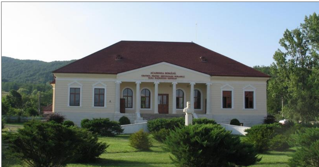
Figure 6. The Nopcsa manor from General Berthelot (Cepraga, July 2014)

Another family which came to be famous in the 19th century is Nopcsa. The Magyar nobles possessed two manors in General Berthelot and Săcel together with another propriety in Densuș. The castle from Săcel was built by a Romanian family and was lost to the baron Franz Nopcsa as a result of some debts (Muntean 2013). The castle was confiscated by the Romanian state after 1918 as with the majority of the Hungarian properties from Transylvania. In the communist period, a special school for orphan children functioned here. The same fate had the manor from General Berthelot (at that time Fărcădinul de Jos), which was donated by the Romanian state to the French general Henri Mathias Berthelot for the assistance provided during the First World War (Nicolae & Suditu 2008). At his death, the general donated it to the Romanian Academy, but in the communist period there was located the headquarters of the local co-operative farm 2 . After the 1989 revolution, the Romanian Academy received the edifice and renovated it in 2010 (Figure 6).