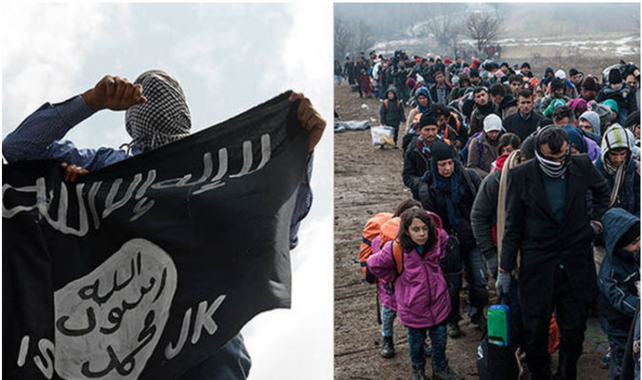
Figure 1. An example of image juxtaposition presenting opposing sides of the Syrian conflict. Note: this image was not used in the stimulus material—see Figure 2 and Figure 3 for stimulus examples (Logan, 2017).

An important omission from this body of work, however, is the study of balanced content, which we know is attractive to audiences when selecting news content (Feldman et al., 2013). By definition, a balanced headline should present opposing sides of an issue. For instance, “ The pros and cons of stricter gun laws in America ”, or “ Syrian refugees: victims or threat? ”. Balance can also be depicted visually in the form of image juxtaposition. Placing two pictures next to each other can serve to emphasise the opposing stances on an issue by directly contrasting them (for an example, see Figure 1). This study adopts this approach to examine the selection of balanced visual and textual content and, to the best of our knowledge, is the first to investigate these types of balanced images that are sometimes seen in news media.