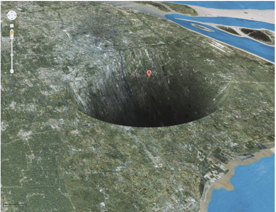
Ill. 1: Google's ubiquitous Maps as a current example, Photo: https://www.facebook.com/MuseumOfInternet/photos/

poration Google (Ill. 1). This poses a question: How are power relationships expressed in the cartographic praxis and representation of Google Maps—specifically, in terms of the previously mentioned strategies of simplifying, centralizing and hierarchizing? The advent of Google's Geo Tools began in 2005 with Maps and Earth, followed by Street View in 2007. They have since become enormously more technologically advanced.