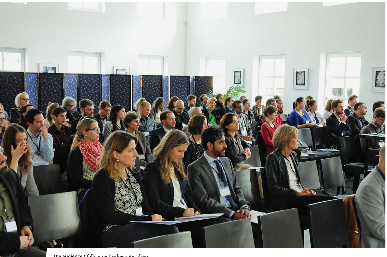
The audience \ following the keynote address

ment that people may occupy over the course of their displacement (IDP to refugee or vice versa); the many vulnerabilities that displaced people experience throughout their journey, including the breakdown of social protection networks; and finally, the ultimate vulnerability of those who are trapped and unable to move. She highlighted how the lack of access to childhood education increasingly appears to be a driver of onward movement from a first country of asylum, particularly since most temporary displacement situations have a way of becoming protracted. She also stressed the need for more attention on displacement-affected communities and what the mass movement of people away from or toward these communities mean for those within them. Another set of characteristics dealt with the perception of displacement—the focus on ‘growing’ statistics of displaced people that need to be analyzed and unpacked; the use of the term ‘crisis’ since the