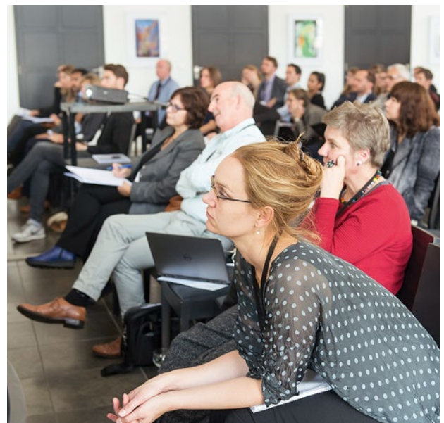
Conference participants \ listening to the opening address