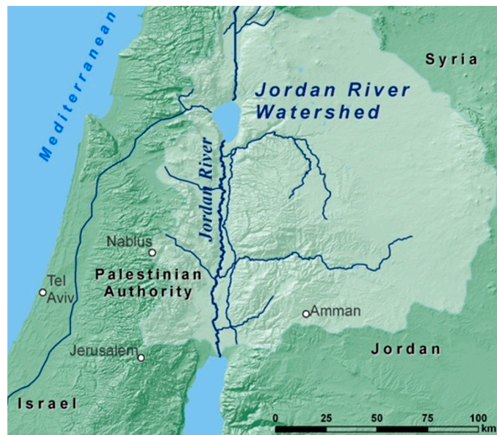
Figure 1. Location map of the Jordan River Region.

Our focus was on the Jordan River region (Figure 1), namely Jordan, Palestine, and Israel, an area that combines many desirable attributes for addressing the problem of tipping points, and conflict or cooperation in a SES. It is located in a global biodiversity hotspot [35] including many progenitors of globally important crops [36]. Additionally, the Jordan Valley is the main eastern migration route for European birds, further making the region an area of global conservation concern [37,38]. These two aspects combine to make ecological tipping points very important as they could lead to dramatic losses of habitats and important plant and animal species. Steep climate gradients and highly diverse socio-economic settings provide an ideal real-life laboratory for studying a variety of ecological and socio-economic drivers as well as their interactions. At the same time, the region suffers from world-record lows in water and land availability and is characterized by highly vulnerable socio-political conditions that impede adaptive management in an era of change [18]. Resource scarcity will be dramatically aggravated by rapid population growth, and subsequent overexploitation of natural resources [18,38] as well as by climate change [39,40] with more frequent droughts [41]. Therefore, the region is not only particularly prone to experience tipping points, but the need for developing pre-emptive management strategies is very high.