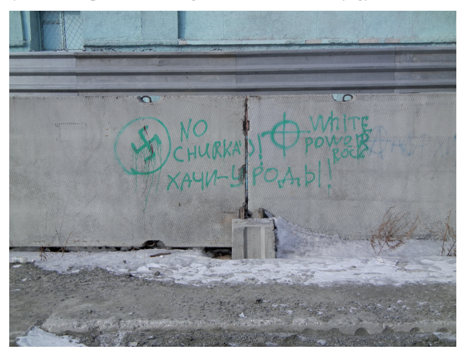
Figure 2: Graffiti on a factory's perimeter fencing in Dzerzhinskii Raion, a district of Novosibirsk. Svastika and cross hairs are accompanied with the slogans 'No churka's', 'White Power Rock' and 'Khachi – urody!' ('Hadjis are monsters!').