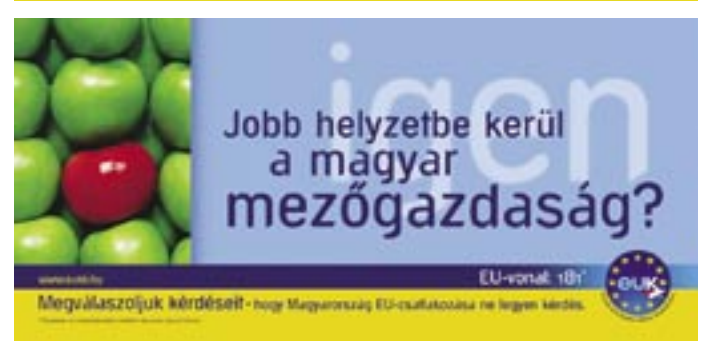
Subjects of the Hungarian accession campaign 2003 (Young & Rubicam)