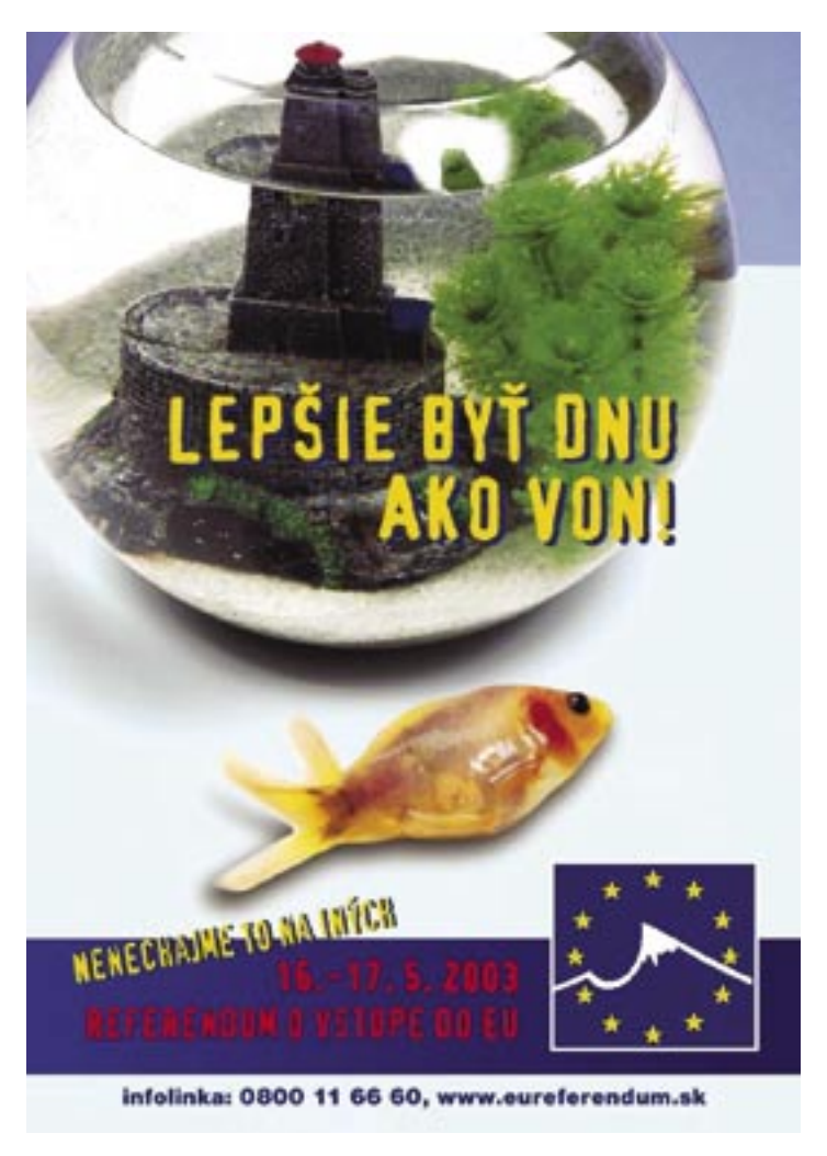
Boomerang free cards/ Slovak EU accession campaign 2003. Slogan: "It's better to be in than out" (Creo/Young&Rubicam)

Positive public attitudes towards EU membership provided ideal conditions for the smooth course of the Euro referendum campaign. The Slovak referendum campaign did not target any specific social group and did not put a question mark over the EU membership issue. It thus reflected the stage of the EU debate in Slovakia, where EU entry was a strategic priority not just for the political élite and above all seen as a ticket for little Slovakia to join a sound and prestigious club.