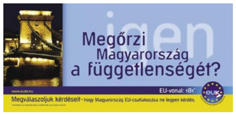
Poster used in the Hungarian EU accession campaign 2003

the metaphor of the bridge, frequently presented in tourism brochures. The image of Hungary as the most western country in Central and Eastern Europe – "Hungary as the Western Part of the East" was the traditional joke about the country during the Kádár period – is quite relevant to the supposed cultural and historical tradition of Hungary. Hungarian culture was always seen as integrating, an identity aspect that is said to help the country to fulfil its European role.