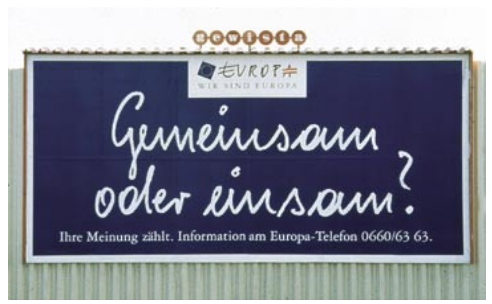
Slogan of the Austrian EU accession campaign 1992–1994

The Austrian enlargement campaign from 2002 to 2004 also resorted to the argument that especially small states are not able to solve their problems alone, by using the slogans "Cross-border problems require cross-border solutions" and "Europe – we increase our chances" ("Europa – wir vergrössern unsere Chancen"). The topics presented as cross-border problems were mainly migration, asylum, crime and ecological issues such as nuclear power plants in the border regions of the country.