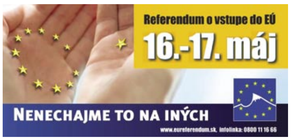
Poster used in the Slovak EU accession campaign 2003. Slogan: "Let's not leave it to the others" (Creo/Young&Rubicam)