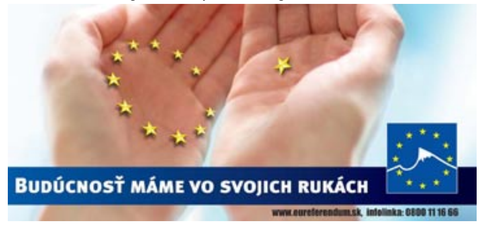
Poster used in the Slovak EU accession campaign 2003. Slogan: "We have the future in our hands" (Creo/Young&Rubicam)

While Slovakia, from the perspective of its citizens, lacked European maturity in the field of politics to some extent, it was clearly pointed out in the media and public discourse that geographically speaking, the country had always been a part of Europe. Nevertheless, fears of a loss of national sovereignty of the small state were voiced in the run-up to the accession. The accession campaign reacted, inter alia, by presenting Slovakia as the missing star in the symbolic configuration of the EU.