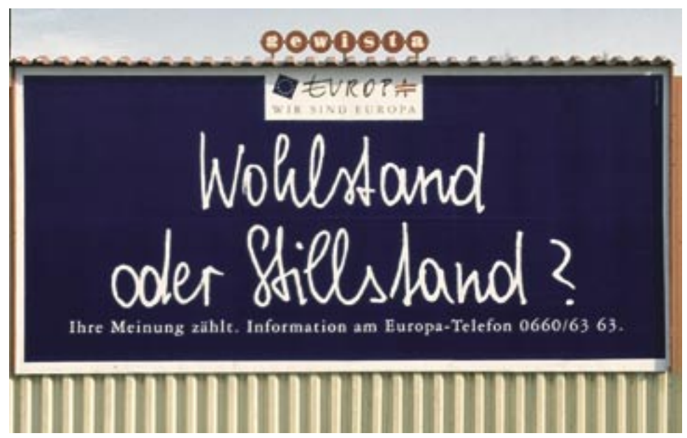
Slogan of the Austrian EU accession campaign 1992–1994

Austrian EU membership was promoted by the government also as a promise for the increase of prosperity and economic growth. The slogan "Prosperity or Stagnation?" ("Wohlstand oder Stillstand?") referred to the "Austrian success story" of the Second Republic that is anchored in the collective memory as a popular auto-stereotype and refers to both political and economic matters. It signals that with EU membership the success story would continue. Staying outside the EU, then, was tantamount choosing stagnation.