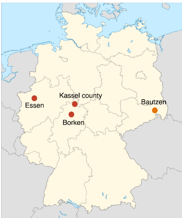
Figure 2. Map of Germany and three case study communities: Borken, Kassel County and Essen in red, and the city of Bautzen as comparative city in orange.

It is worthwhile to emphasize that the work of the government at the federal, state, and local levels has been substantially aided by a wide variety of non-governmental initiatives. In Germany, a well-functioning civic structure has been very supportive. In addition to the city administration, religious organizations, non-