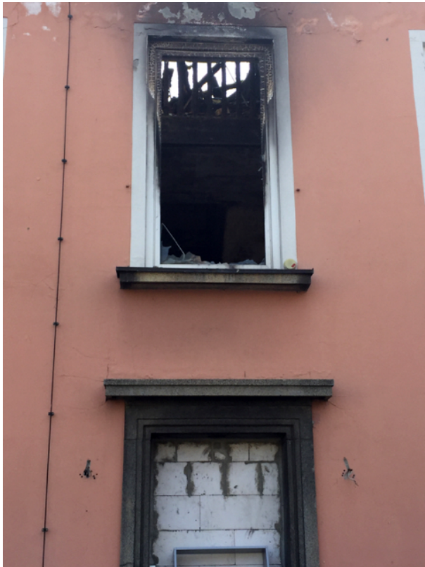
Figure 11. The burned out Husarenhof Hotel in Bautzen, originally intended for refugees.