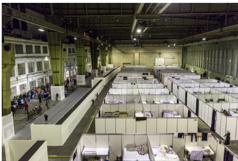
Figure 4. Refugees being housed in disused Tempelhof airport in Berlin, 2015.