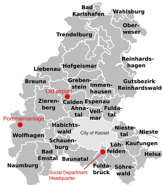
Figure 7. Map of Kassel County with various individual municipalities and locations, including the community of Wolfhagen and the Pommernanlage, the old airport buildings in the municipality of Calden that served as a federal refugee camp, and the main Social Department Headquarters location in Kassel County.

It is important not to make a parallel world here in the camp. It is important for people to have structure and purpose, and to feel that they have some involvement. That is why there are no groceries here [at the camp], and why the German course is offered in town.