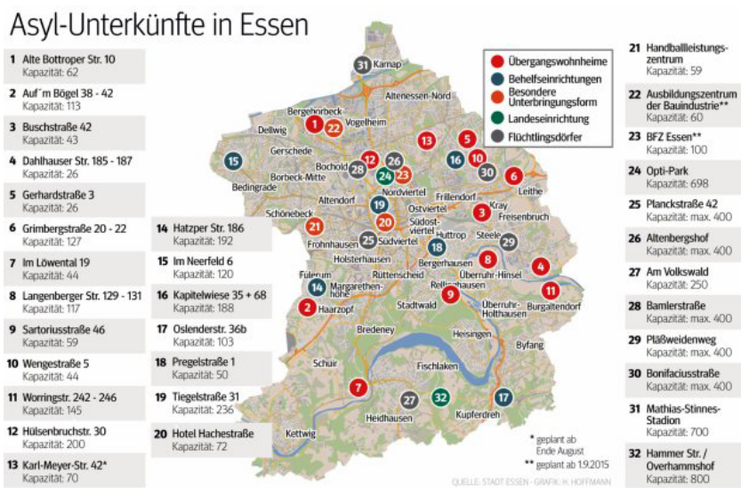
Figure 3. Map with different kinds of shelters and small camps for refugees in use for a limited time in the City of Essen in 2015-2016. Source: Der Westen (2015).