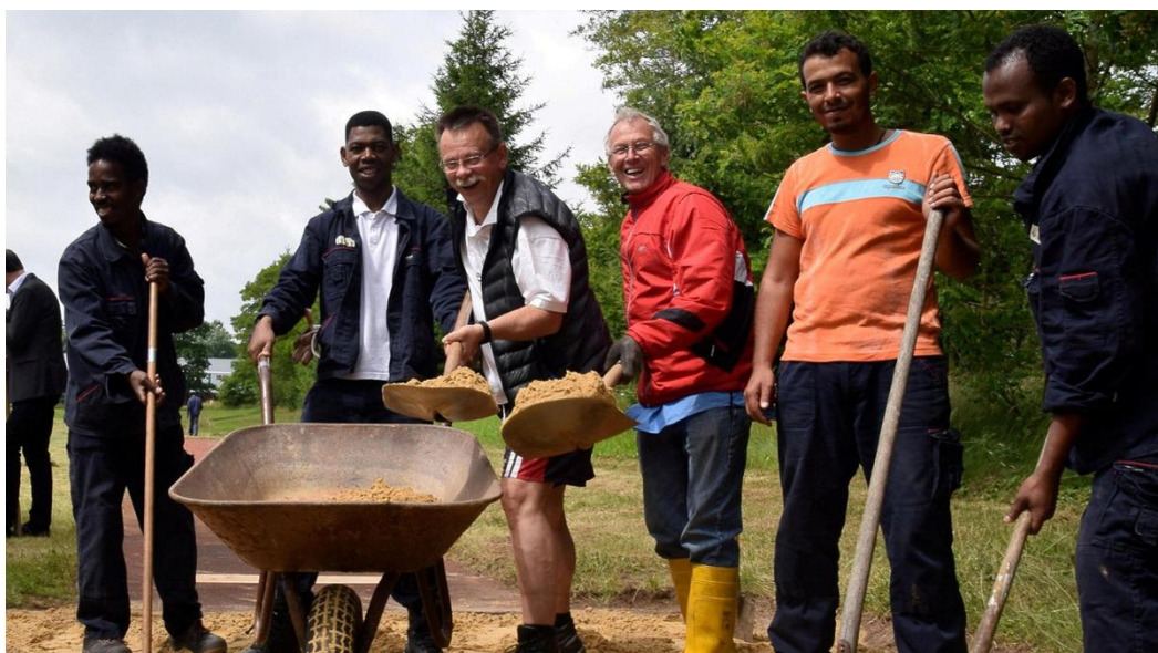
Figure 9. Refugees and local people renewing the sports field at Pommernanlage.

Germany is not a traditional immigration country; there are only two mechanisms through which migrants and refugees may apply for legal residency in the country. First, Article 16a of Germany’s 1949 Constitution includes provisions for asylum seekers. Second, federal law includes an “exception” policy, which states that the country does not allow immigration, except as appealed on a case by case basis (for example, for people who have married German citizens or for those with special work in Germany; see Federal Ministry of the Interior, 2018; S. Scherer from the County of Kassel gave us a thorough introduction to German asylum policy on August 1, 2016). Refugees apply for legal status through the asylum law. Asylum application processing can take from a few months to more than a year. During the interim period