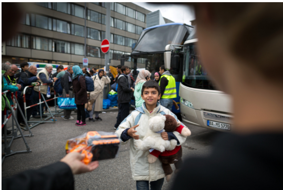
Figure 1. Syrian refugees reach Munich with trains from Austria on Sunday, 6 September 2015.