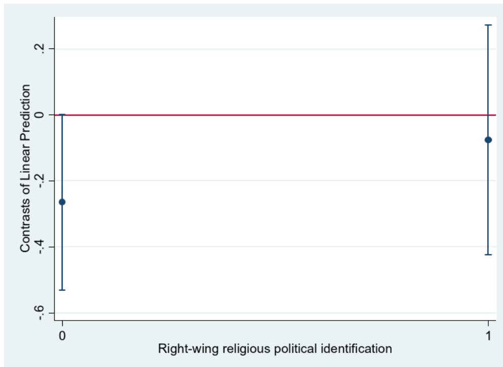
Fig. 2 Contrasts of predictive margins of asylum seekers with 95 % CIs

religious political identification on rejection of humanitarian policy measures is not significant. The effect of the asylum seekers frame for other respondents is borderline significant and larger. Both the effect of perceived threat and of right-wing political identification were significant and in the expected direction ( b = 0.38 and 0.36 , respectively, for perceived threat and for right-wing or religious political identification).