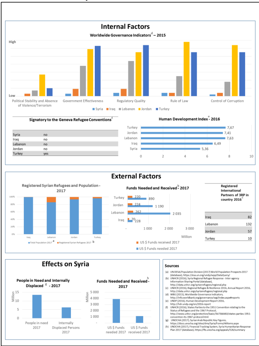
Box 1. Facts on the Syria crisis