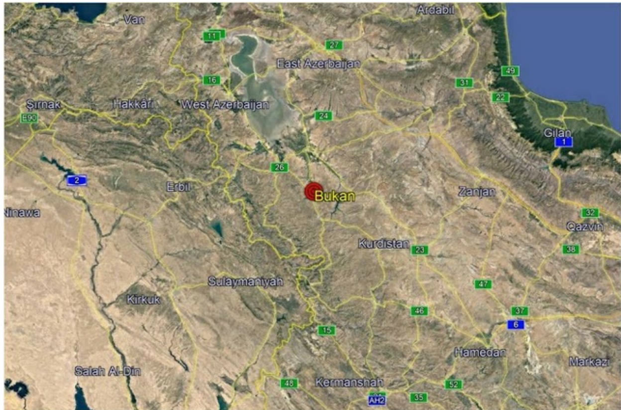
Map Attribute: Location of Kurdish attack on July 7 in the vicinity of Bukan City

The incident follows a similar attack by another Kurdish militant group ‘ Zagros Eagles ’ on an unidentified Iranian military check post in the city of Piranshahr located south of the Iraq-Turkey- Iran trijunction area on July 2. Like most claims by the Kurdish groups, the veracity of the incident remains to be ascertained. While localized attacks by Kurdish separatist and militant groups targeting Iranian Law Enforcement Agents and IRGC personnel are not unprecedented, the incident continues to be significant as these attacks have recorded a significant uptick since the preceding months. This has resulted in increasing troop buildup in the region, especially in the Piranshahr, Oshnavieh and Sardasht region along the Iraqi and Turkish border to counter the emerging threat posed by these Kurdish separatist groups in the Islamic Republic. The Iranian anxieties are further exacerbated by the latest visit of Mustafa Hijri, the head of the PDKI to Washington between June 11-17, seeking US assistance in carrying out operations against Iran. The notable Kurdish gains in Syria and Iraq amidst ongoing counter-militancy operations against Islamic State (IS) thus serves as a ready reference to Iran of the potential threat to its internal security posed by such an alliance.