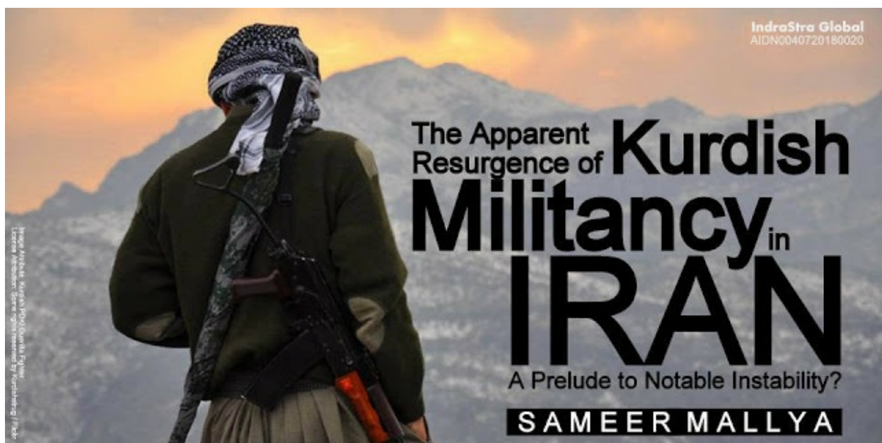
Image Attribute: Kurdish PDKI Guerilla Fighter

The Democratic Party of Iranian Kurdistan (PDKI) on July 7 reportedly claimed to kill and wounding of at least four Islamic Revolutionary Guards Corps (IRGC) personnel in the West Azerbaijan province's Koke village in the vicinity of Bukan city. The claim remains to be substantiated by official Iranian agencies at the time of writing.