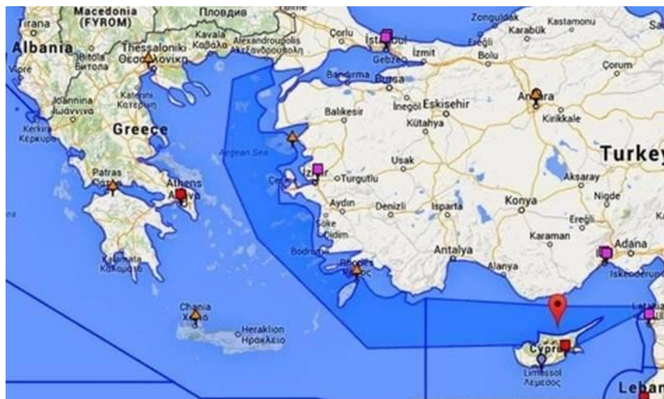
Figure 3. Greece Claim in the Aegean