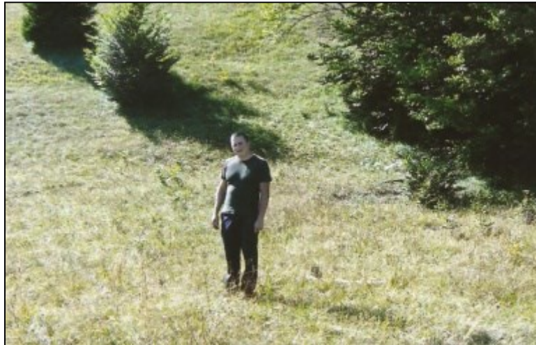
Figure 1. Perinka – are here to live ancient people? 1

manner. The first is located above the Kagina Ornice - plateau in a circular shape named Korita, the other named Rajkova Plains, the third Perinka in owned Dragoja Krstova Rajović, which is located between the Kraja and Dola Novović. It is interesting to point out that the last two plateaus have a circular shape, and both the edges of their spring water. "It appears likely that these sites were the habitat of some of the livestock of the village from the old times [3].