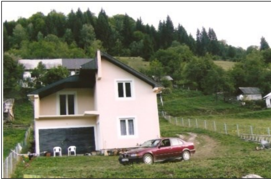
Figure 3. Modern house built in 2007 - Partially housing.

How is Gnjili Potok of the seventies of the twentieth century, the depopulation reached proportions that can hardly be stopped, a number of residential properties (5), and a trade (the former State general store), abandoned and left to chance and natural aging. On the other hand, there is the problem of seasonal or occasional use housing units (houses). Such is the rotten Potok 37 Accordingly, the former permanent resident's Gnjili Potok only summer or winter, come and spend a certain time in the form of vacation or partial housing.