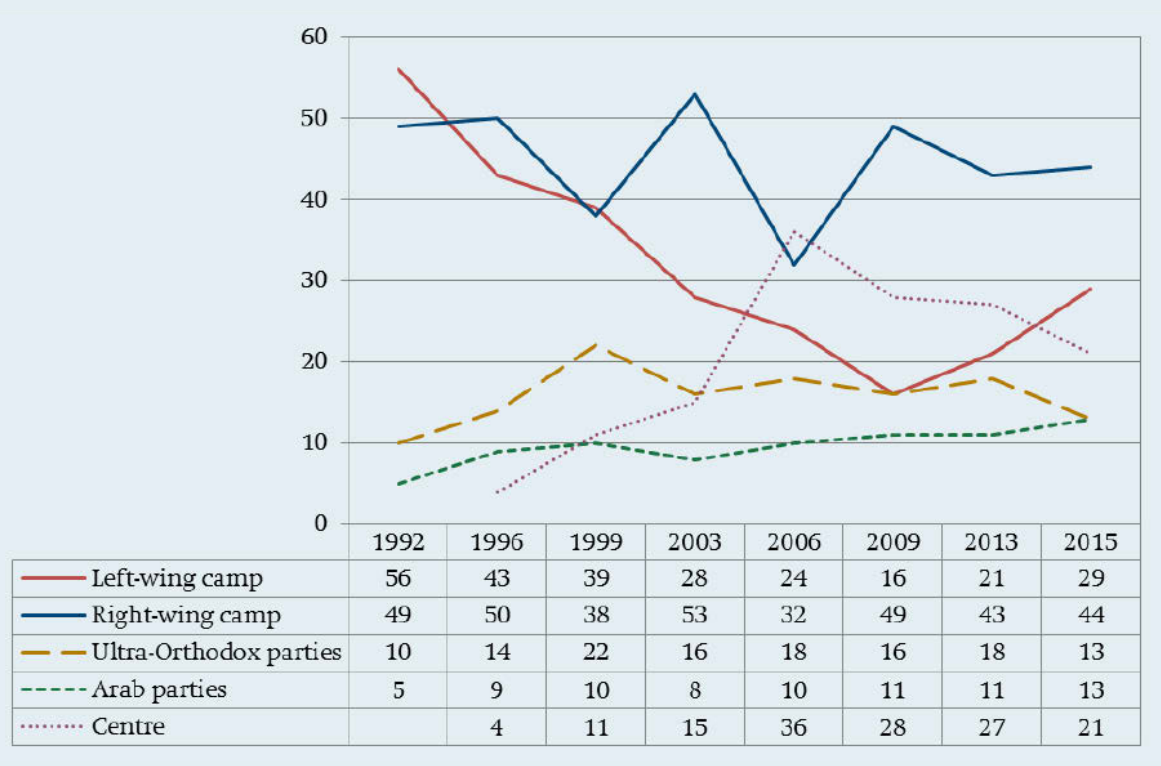
Figure 1 Political camps in the Israeli parliament since 1992 (number of seats)

Data from Knesset website, classification into camps by author.