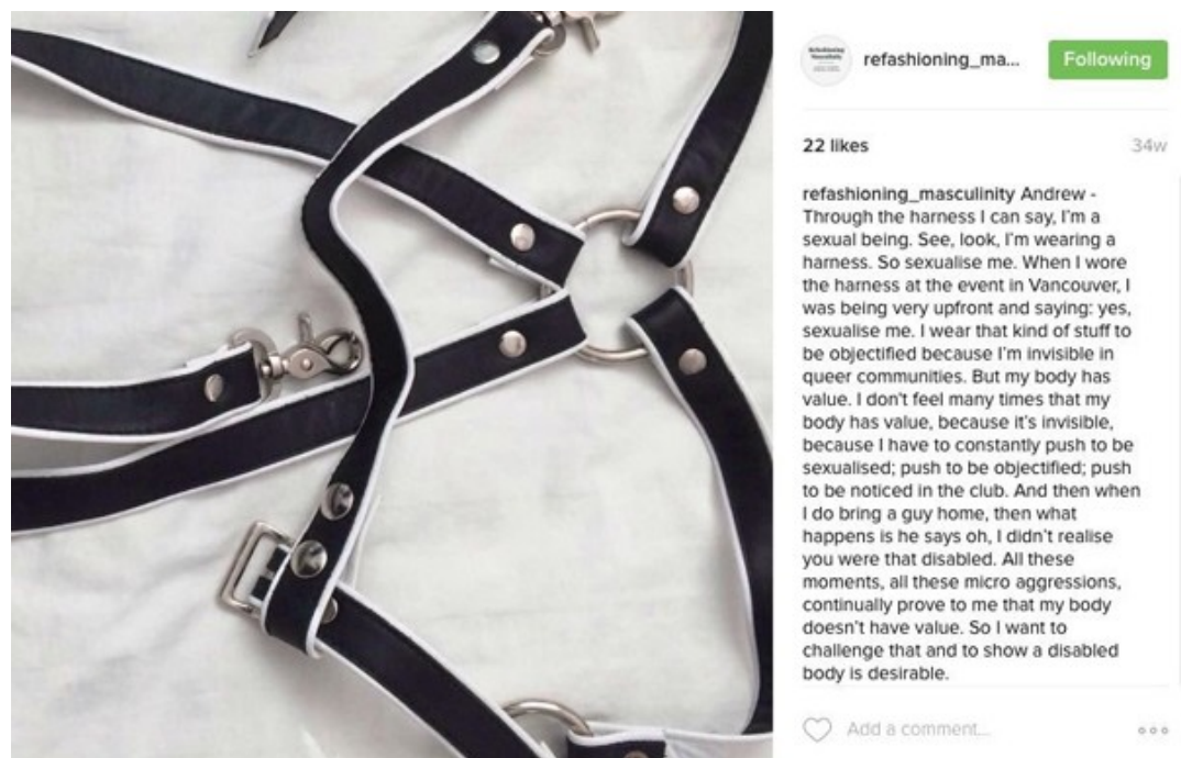
Figure 1: Sample Instagram post from "Refashioning Masculinity" fashion show [15]