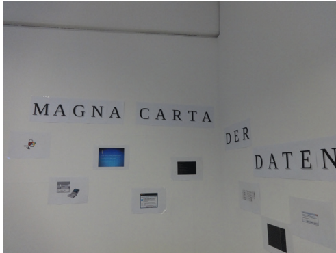
[Fig. 5] Exhibition: Dysfunctional Things. Project: Magna Carta der Datenrechte / Magna Charta of Data Rights (Martina Keup). Photography: Martina Leeker & Laila Walter, Lüneburg 2016.

Data rights have become a very important topic in the world of Owlglass prank in the exhibition, because smart things are technical devices controlled by algorithms collecting and processing data.