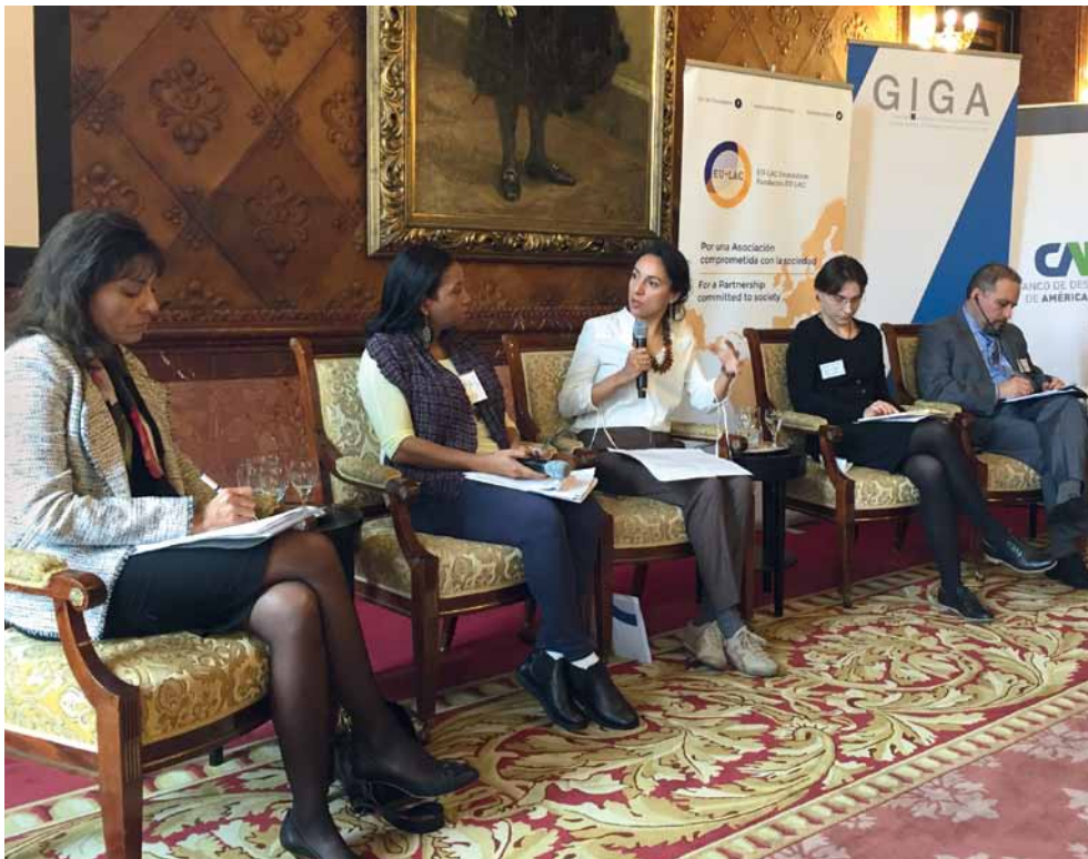
Participants at the "Forging Bonds with Emigrants" conference, which was held at Hamburg City Hall