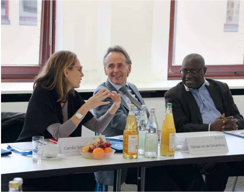
Participants at the GIGA Global Transitions Conference