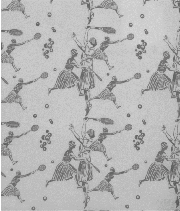
Printed silk crêpe de chine dress fabric, designed by Helen Wills for Stehli Silks, New York, 1927. Courtesy of the Victoria and Albert Museum, London.