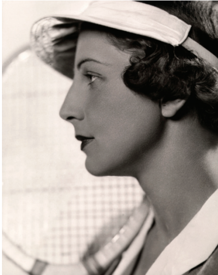
Bromide Print, 1933 (218 mm x 174 mm).