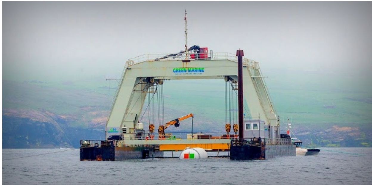
Image Attribute: Deployment of Natick datacenter, Orkney islands, Scotland, U.K.

On 5th June 2018, Microsoft announced the launch of — "Northern Isles Data-center" — self-sufficient underwater data centers, being submerged in a shipping-container-size capsule, 100 ft below the surface of the North Sea near the UK's Orkney islands, fully powered by renewable energy. Orkney islands-based European Marine Energy Centre has partnered with Microsoft to provide necessary cabling for power supply and internet access to the prototype.