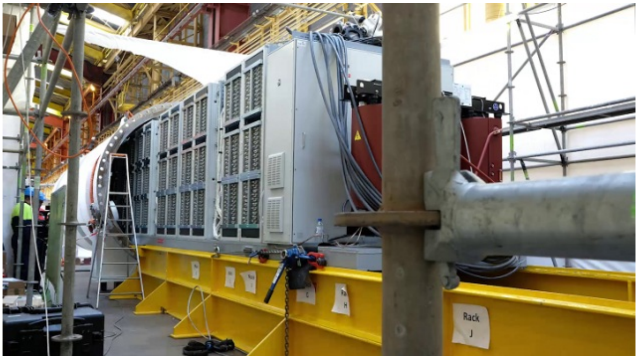
Image Attribute: Project Natick's Northern Isles datacenter at a Naval Group facility in Brest, France. The data center has about the same dimensions as a 40-foot long ISO shipping container

Microsoft says it will operate the prototype for 12 months. First, it'll put the servers through a battery of tests to check on power consumption, humidity levels, noise creation, and temperatures. Then the company will let some customers use the data center. If successful, Microsoft will keep operating the servers, and allow its customers to use it to run their own computations.