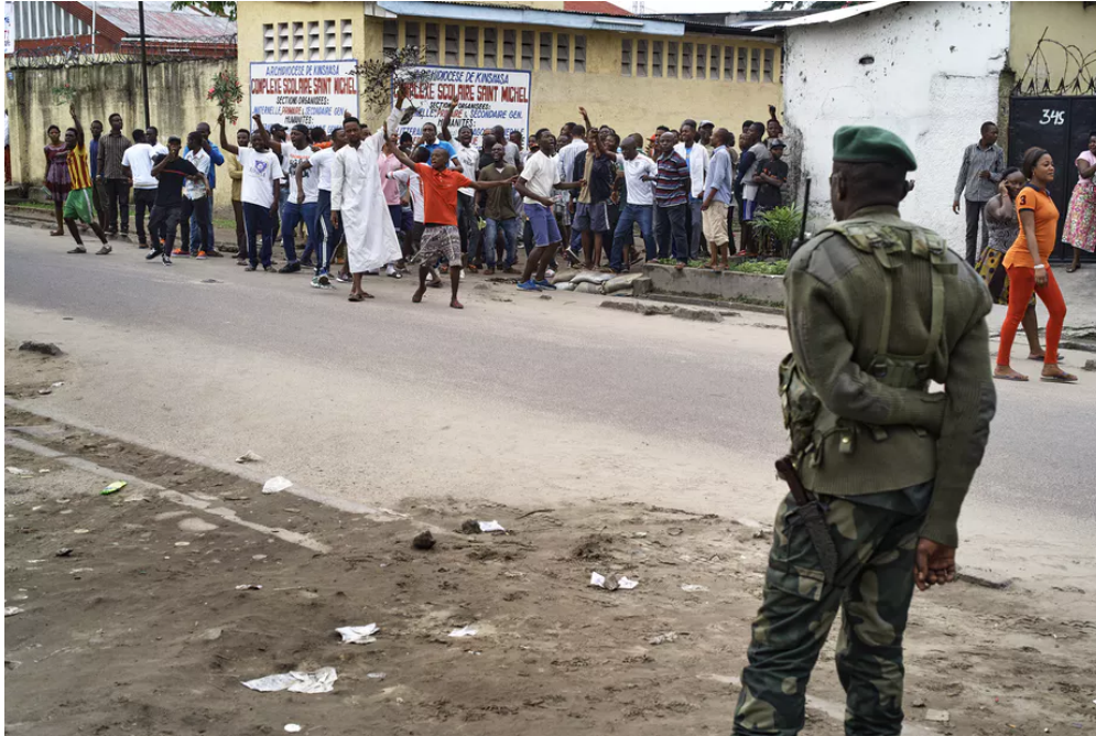
Citizens protest on the streets of Kinshasa in the DRC.