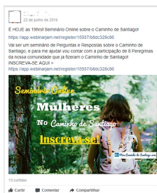
Figure 2. Internet user offers a course for women in the group Camino de Santiago

It is common to find offers of products and services, most of them aimed at pilgrims. However, we noticed that some posts receive harsh criticism while others have positive manifestations (likes, shares, etc). Negative reactions refer to advertisements of items not related to the Way or that are made by companies. The publications that receive positive interactions are related to products and services associated with the Camino de Santiago (The Way of St. James), where there is no explicit identification that it is part of a larger commercial enterprise.