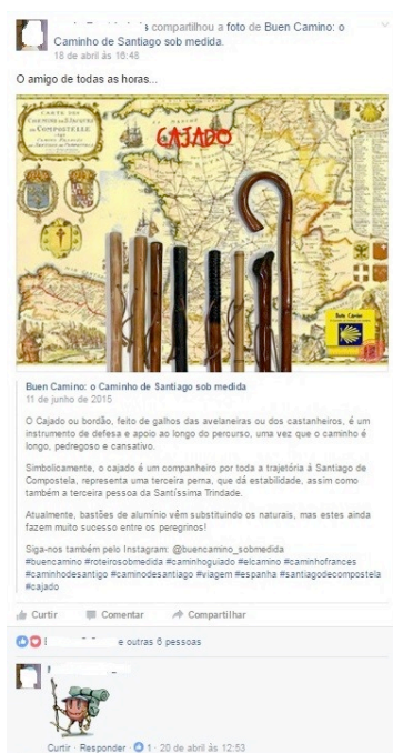
Figure 4. Post made in the group Caminho de Santiago in which the focus is in the use of the staff. The author of the publication comments beneath, probably for the purpose of gaining more visibility.