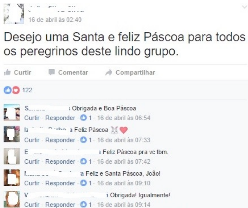
Figure 6. Post made in the group Caminho de Santiago de Compostela . Text: 'I wish a Holy and Happy Easter to all the pilgrims of this beautiful group'. In the answers, the participants thanked and wished 'Happy Easter'.