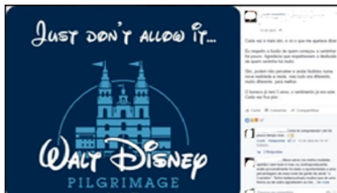
Figure 1. Publication pinned in the group Caminho Central Português para Santiago de Compostela .

Only to seriously discuss the Caminho Central Português para Santiago de Compostela . All due to the seriousness of the itineraries of pilgrimage and, always, against the prostitution of the yellow arrows to the taste of the political and economic interests. Any type of advertising, namely commercial housing and, above all, profitable organizations of pseudo-pilgrimages will be erased, and their authors will be dispatched from this group 4 .