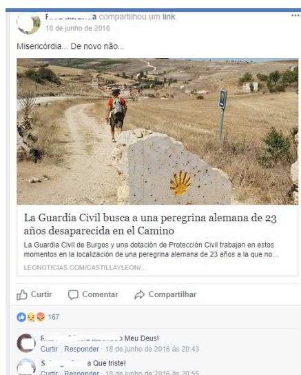
Figure 7. Post narrates that the civil guard is looking for a German pilgrim of 23 years that got lost. In the comments, the participants mourn and fear for the worst. Publication text: 'mercy ... Not again ...'.

When the Way is a topic in the press, the links of the articles are shared. This type of content often engages many members. In June 2016 there was consternation in the Caminho de Santiago group when a German pilgrim disappeared. In the comments, the netizens showed concern and updated the information 5 . Some recalled similar cases, either to tranquilize or alert.