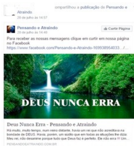
Figure 5. Posted in the group Caminho de Santiago de Compostela from the page 'Thinking and Attracting' brings an optimistic idea about life from a short story. There is a reference to God, but without identifying with a particular religion.