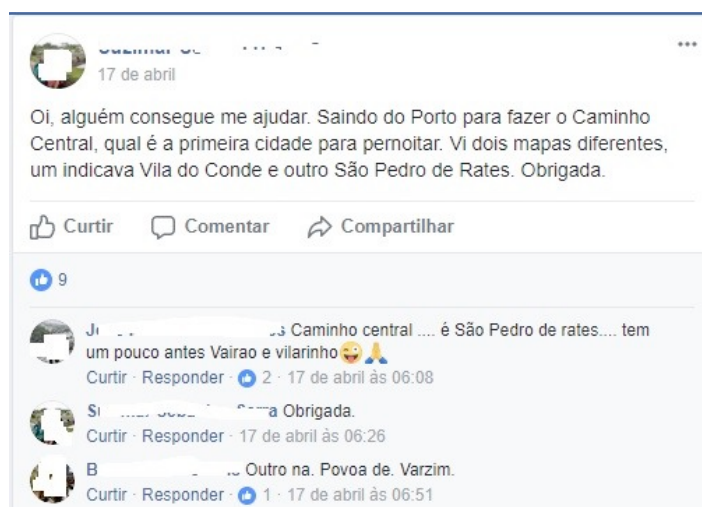
Figure 8. Post extracted from the group Caminho Português - Porto a Santiago de Compostela . The participant asks which city to stay overnight from the route they are taking. Participants suggest cities.

Another type of common publication corresponds to requests for help and suggestions. The most frequent are people interested in going through the Camino de Santiago (The Way of St. James) and ask for help or those who have already gone through it and give recommendations. So, the talking is about themes like ideal backpack weight, places to meet, shelters to avoid, movies and books, etc. This type of publication, together with the reports and the news are the ones that generate more involvement. This reinforces the character of a 'learning group' (Flichy, 2012). Once having made The Way of St. James, the pilgrim passes from ignorant to the condition of 'amateur' for the other members. That is, he becomes respected in the space for having passed through that experience and can, therefore, help other members. Obviously, we noticed that some participants are more active, going through the pilgrimage more than once, or keep blogs and pages on Facebook about The Way of St. James. These end up becoming references to the others.