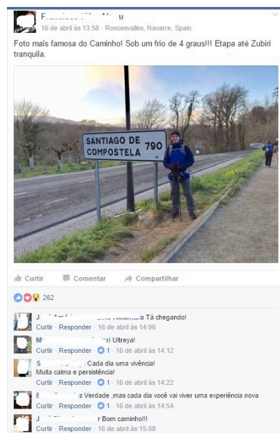
Figure 9. Pilgrim reports his experience in the first kilometers of his itinerary in the Caminho de Santiago group. In the pilgrims' comments, they desire 'Good way'.