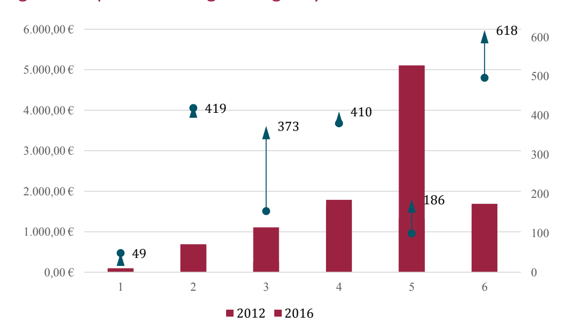
Figure 2: Operative budget of agency and staff

To start with, how did the individual agencies develop in the last five years? Figure 2 shows that, while the overall staff levels as well as the overall operative budget has been increased for all six agencies, there are substantial differences for each of them. Specifically, the operative budget of agencies differs widely, and so does the increase between 2012 and 2016. Also, staffing levels have developed very differently, with EASME more than doubling, and REA, INEA, and ERCEA at least significantly increasing their staff, while CHAFEA and EACEA were even downsizing somewhat.