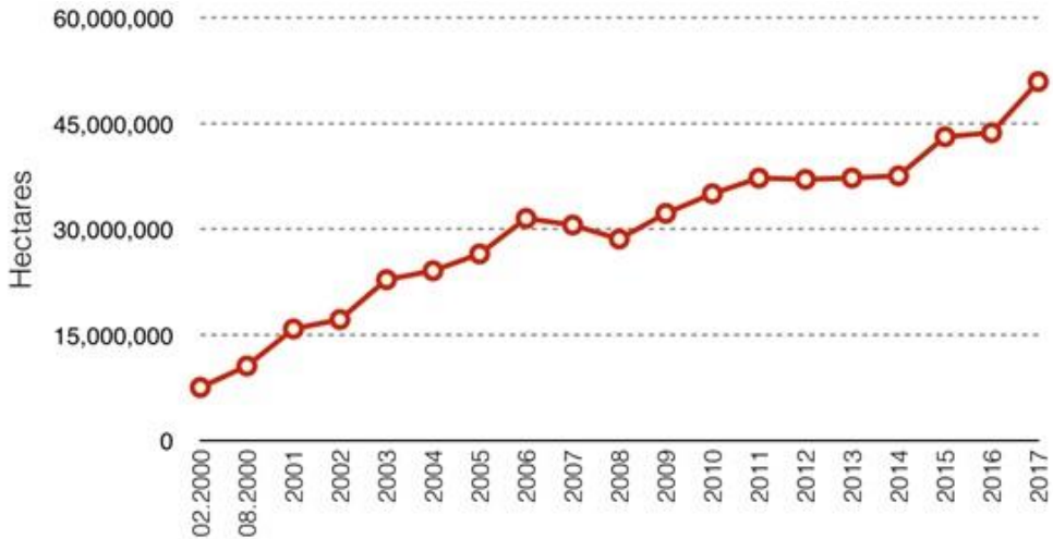
Figure 1. Certified organic agriculture hectares have grown at nearly 12% per annum for the past two decades but currently account for only 1.1% of world agriculture (Source: (Paull, 2017a)).