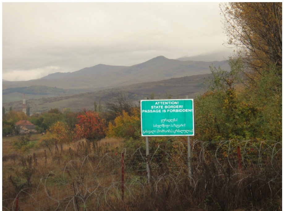
Photograph 1: Fence on the Administrative Boundary Line near Khurvaleti, Georgia 2015 (Edward Boyle)

The fencing involved in the borderization process, then, is also a symbol of this disengagement, rather than just the means to bring it about. While there is nothing primordial or timeless about South Ossetia, its claims for existence as a state have necessitated fixing the territory of South Ossetia through the fencing out its geographical space. The material effects of the fence are felt at the local level, but it is the continued (re)production of the border, through the discourse that surrounds this borderization process, which grants these artificial barriers such performative power. In invoking a global symbol of division by describing this snaking course of barbed wire and lengths of chain-link fencing as a “Little Berlin Wall”, Chagelishvili is not merely seeking to position the barrier in Khurvaleti and elsewhere as being of wider interest. He is also taking advantage of the connections already drawn between the various scales within which these barriers are symbolically mobilized. In so doing, he is transforming the tableaux upon which this “Little” wall exists to