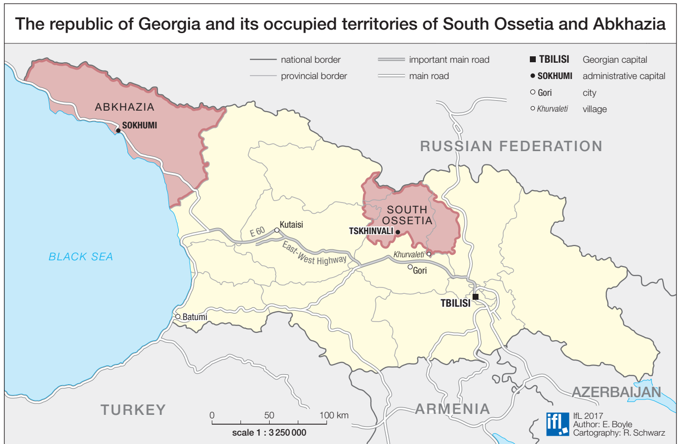
Fig. 1: The republic of Georgia and its occupied territories of South Ossetia and Abkhazia

of Nagorno-Karabakh more indirectly, through Armenia). The coming to power of Mikhail Saakashvili's United National Movement (UNM) in Tbilisi in 2003, and its promises to reassert Georgia's territorial integrity (KABACHNIK 2012), culminated in the August War of 2008 and subsequent recognition of South Ossetia and Abkhazia as independent states by the Russian Federation.