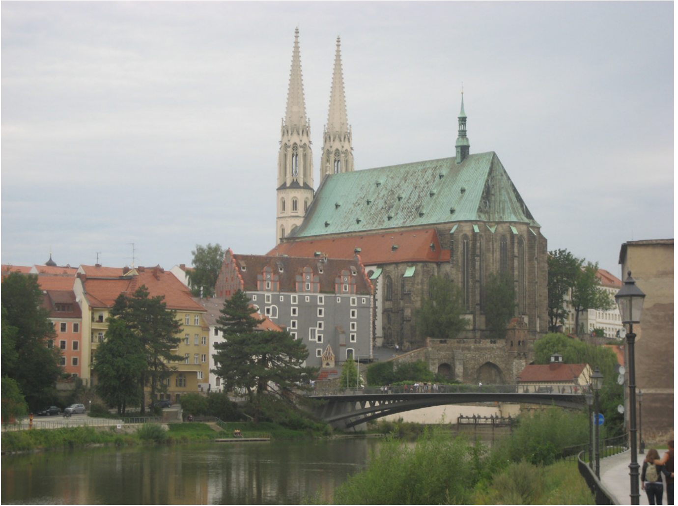
Fig. 3: Old Town Bridge, Goerlitz 2008

philosopher and poet Jacob Boehme. Now this building has been turned into a museum of the philosopher, which possesses no authentic artefacts except the house itself (some artefacts can be found in Goerlitz), while the guide just narrates the biography and philosophy of the house's famous dweller. The office of Euroopera was and still is located in this building, while the organization itself was one which started discussions concerning the preservation and rehabilitation of the architectural heritage of the Neisse suburb.