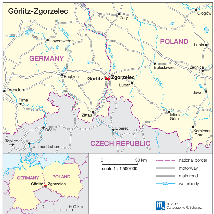
Fig. 1: Goerlitz-Zgorzelec

Zgorzelec acquired the status of a town only in 1945, when the Oder-Neisse line was established, and since that moment has been developing without an old town core (Fig. 1). In such a setting, the Zgorzelec Neisse Suburb is one of the few sections of the built environment currently associated with the historical old town of Goerlitz. Most of the buildings located there are from the nineteenth century, while there are also buildings from the sixteenth century, including the house of Jacob Boehme, which has been turned into museum. Up until 2005, the Neisse Suburb infrastructures were in very bad condition. However, its social meaning was radically reconfigured after Poland's accession to the EU and the re-opening of the Old Town Bridge in 2004 (Fig. 2, 3). This newly built bridge thus connected the Neisse Suburb on the eastern side of the river with the historical centre of