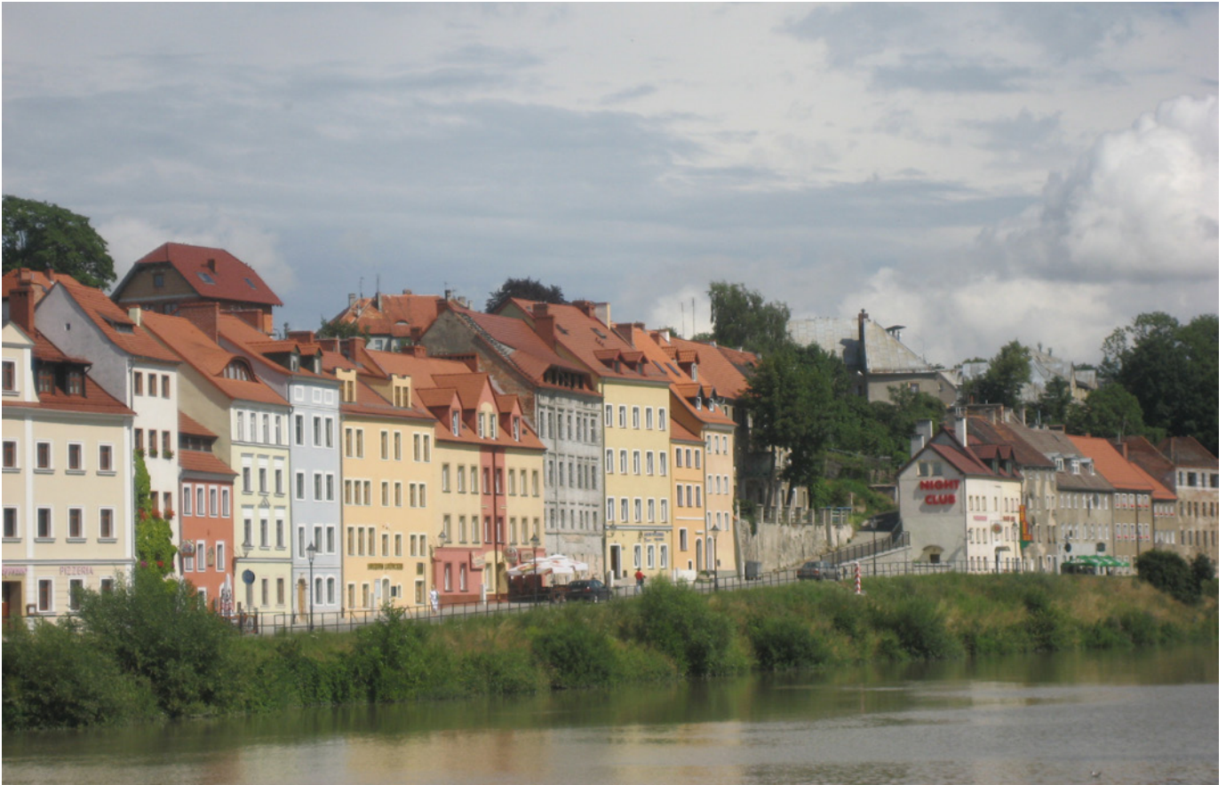
Fig. 5: Neisse Suburb, Zgorzelec 2008

Goerlitz. They show that although the narrativization and branding of the rehabilitated built environment of the Neisse suburb as a certain urban and trans-national centre is dependent on professional focus and employer, the perception of it as a certain currency “directed to the outside” (i.e. to Goerlitz) remains stable. As another interview partner, Z. B., employed by the City Cultural Center ( Dom Kultury ) of Zgorzelec and engaged in various local cultural projects, comments on the course of the revitalization of Neisse suburb and its effects: “The German side is the magnet”. In this respect, it is possible to argue that the very term “showcase” becomes possible due to scalar reformatting. And it is the Old Town Bridge, as a material element of the built environment, that articulates this reformatting on the urban scale of both Zgorzelec and Goerlitz. Opportunities for questioning or contesting the notion of the centre of the trans-border urban unit(s) appear due to the changing scalar formation and change of