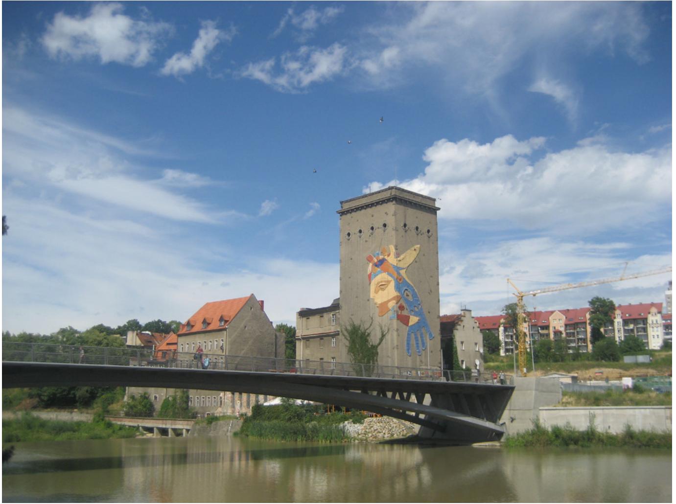
Fig. 2: Old Town Bridge, Zgorzelec 2008

Goerlitz on the western side. This project was not only a highly symbolic gesture in the course of Poland's accession to the EU and the growing intensiveness of trans-border cooperation in a town which had been divided, and sustained as divided, partially by the destruction of all of its seven bridges during World War II. It was equally a strategic investment into the built environment that significantly transformed the urban scale of Zgorzelec, of Goerlitz, and of both taken together as a European twin town in the new context of the enlarged EU (LIUBIMAU 2011).