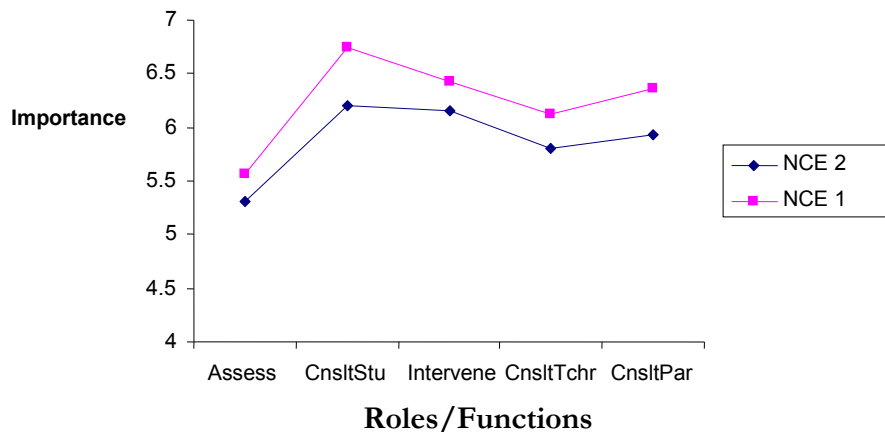
Figure 2. Roles and functions importance rating of NCE 2 compared with roles and functions importance rating of NCE 1.

Table 2 and Figure 2 show the mean ratings of various roles/functions of school psychologist by NCE 2 and NCE 1 and standard deviations. It was found that the overall mean rating of the various roles/functions of school psychologist by NCE 1 was statistically significantly higher than the overall mean rating of the various roles/functions of school psychologist by NCE 2, F(1,162) = 6.49, p < .05 .