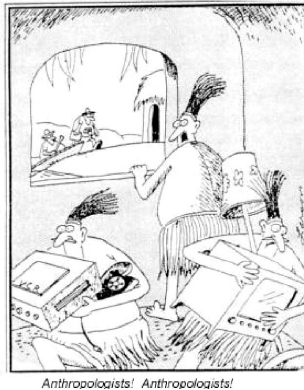
Figure 2 'Anthropologists! Anthropologists!': Reciprocal Pre-expectations.

to offer, much of which has not been recognized up until recently (Heckathorn & Jeffri, 2001).