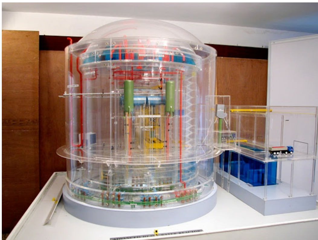
Image Attribute: Model of Advanced Heavy Water Reactor, the latest Indian design for a next-generation nuclear reactor

In general, the novelty of AHWRs includes, among other things, its advanced and innovative safety features, intrinsic proliferation resistance, cost-effectiveness, and efficiency. Given the concerns of nuclear accidents especially after the Fukushima accident, AHWRs are endowed with all such techniques and arrangements that can address postulated threats, both on design basis and beyond design basis. Therefore, it will not require an ‘exclusion zone’ beyond the plant boundary.