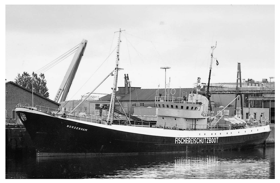
Fig. 4 The trawler Nordenham as a provisional fishery protection vessel.

ship<sup>12</sup>, but its real duty was also to provide German trawlers with information about the operation areas of the Icelandic coast-guard vessels and if possible to assist the trawlers against the use of the trawl wire cutters.