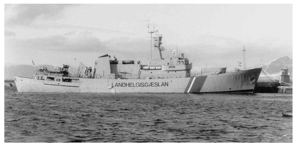
Fig. 5 The Icelandic coast-guard vessel OĐINN, the most important Icelandic ship in all the conflicts on fishing limits after World War II.

The coast guard was increasingly successful in its struggle against the German trawlers and in October 1973 the OĐINN alone managed to cut the entire gear of three trawlers in less than ten days. <sup>13</sup> A few days later the German government announced the sending of two further auxiliary fishery protection vessels to Iceland and beginning in January 1974 there were seven such ships operating in the Icelandic area. All were called hospital ships, but their duties comprised much