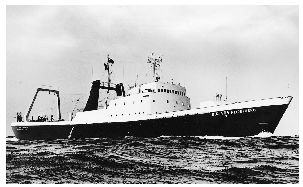
Fig. 1 In the 1970s, the factory-stern-trawlers of the so called Universitäts-Klasse made the German deep-sea fisheries fleet one of the world's most sophisticated fishing fleets.

Soon after World War II, the German deep-sea trawling industry started the rebuilding of the fleet and fishing operations in areas far distant from their homeports at the German Bight. The grounds off Iceland quickly became one of the most important fishing regions for this fleet once again. Therefore it was no wonder that Germany was involved in the conflicts about fishery limits like any other European fishing nation. But during the twelve-mile conflict in the 1950s the Federal Republic of Germany was a young nation with a very special position in the field of international political affairs. Germany was not in the position to play a major role in the conflict. In fact Germany accepted the Icelandic claims to the twelve-mile limit virtually without engagement in the conflict. Nevertheless, there was one aspect which would become important for the further development. After the conflict between Great Britain and Iceland was settled, the Federal Republic claimed a position similar to that of Great Britain regarding fishing rights off Iceland, and they were granted. Particularly one point in the agreement of 1961 would become relevant in the future: Iceland and Germany agreed that a further widening of the Icelandic fisheries limit should be announced to the Federal Republic early and the International Court of Justice was accepted as a court for any conflicts that might result from any further action taken by Iceland.