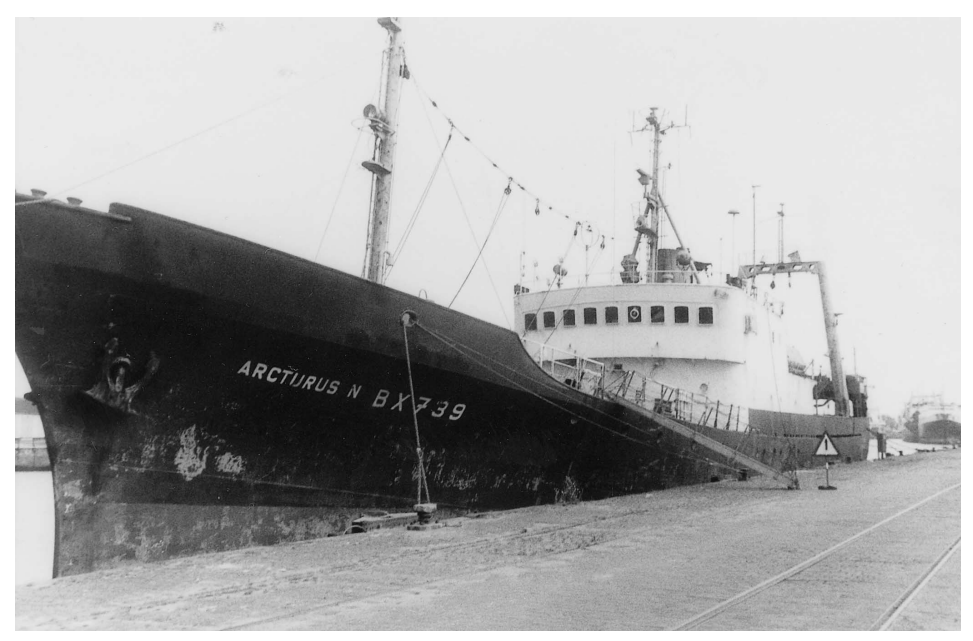
Fig. 6 The trawler ArcTurus, the only German ship to be captured by Iceland.

more than the provision of medical and technical support to the fishing fleet. In a verbal note issued by the German embassy to the Icelandic ministry of foreign affairs, the tasks of the fishery protection vessels were described as follows: