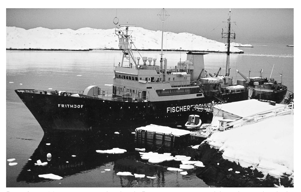
Fig. 7 German fishery protection vessels such as the FRITHIOF were not navy vessels but civilian vessels under the flag of the ministry of agriculture.

the GATT. Furthermore, while the conflicts between Iceland and all other fishing nations had been settled, Germany continued trawling inside the limit and continued bilateral negotiations.