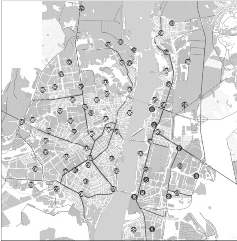
Fig. 2. Sites of collecting atmosphere, snow cover, and soil samples in Voronezh

The digital basis — a map of Voronezh — was divided into six major thematic layers: