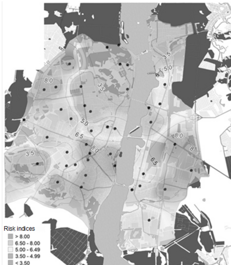
Fig. 4. Integrated assessment of environmental condition of Voronezh (IDW interpolation)

The final element of the integrated assessment was the production of a map showing gradient differences in environmental risk indices accompanied by processed data from the most representative environmental monitoring sites (fig. 4). According to the map, there is an approximately three-fold difference in risk indices between environmentally safe periphery residential complexes, on the one hand, and the centre and industrial and heavy traffic zones, on the other.