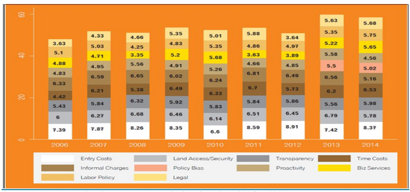
Figure 2: Changes in Scores of sub-indices from 2006 to 2014

Therefore, PCI in this study only includes 9 sub-indices. Figure 2 illustrates the annual scores in governance sub indices, by depicting the score of the median province on each sub index over time. More detail on the specific survey questions and indicators used in the index construction is available in the annual reports.