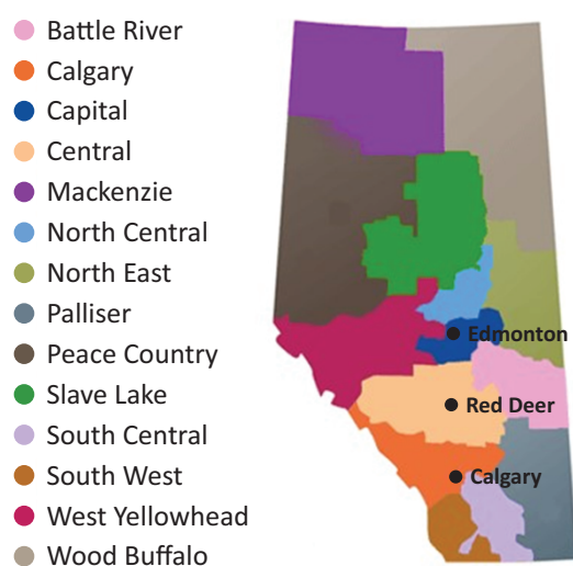
Figure 1. Alberta economic regions (2015).

Within these communities we identified and contacted key individuals in government and the local social services coordinating organizations which are allied with