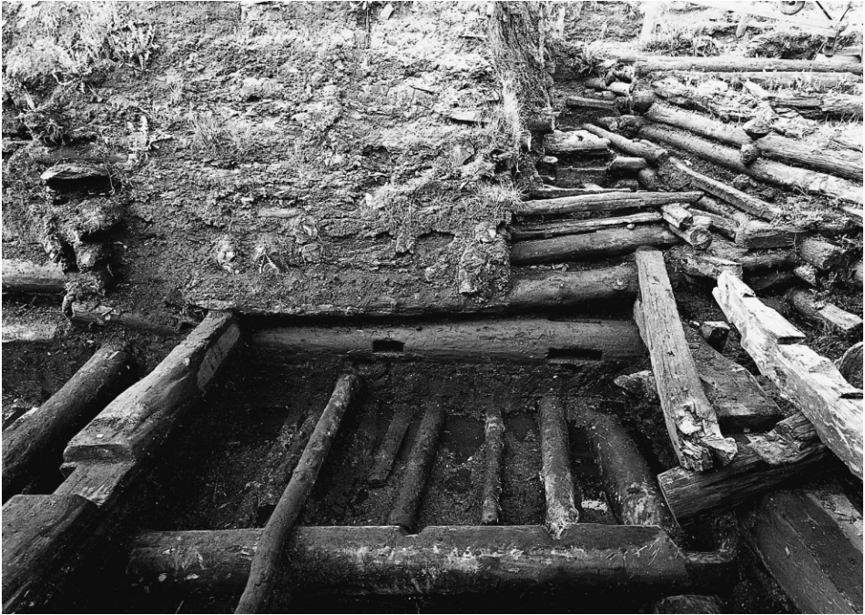
Fig. 1 Big Ship fragments in situ. One of the mast beams is seen on the left, the windlass in the middle and part of the keelson on the right.

The keelson is preserved in two pieces, originally treenailed together. The full length is 12.5 m (Fig. 2). The keelson is shaped on the lower and upper side for floor timbers and low-set crossbeams. The outer ends of the crossbeams are notched for clinker strakes. Two especially sturdy crossbeams form the mast step. A couple of futtocks, two sharp floor timbers from the end of the ship and a huge windlass drum were reused, as were two crossbeams with heads, small fragments of planking and a few more fragments of the framing, damaged to various degrees in the process of reuse. All fragments are of pine. The cross section of the ship at the mast, shown in Fig. 3, is based on the crossbeam in front of the mast, a floor timber exhibiting a good fit beneath the crossbeam and keelson as well as a sensible curve up from the crossbeam, with support in the two futtocks found. The beam at the sheer strake will then have been about 9 m in length. With a beam/height ratio of 2:1 we can postulate a total depth from the sheer strake to the underside of the keel at approx. 4.2 to 4.5 m. The principle of low-set crossbeams over short floor timbers and especially strong beams forming the mast step is known from other, smaller wrecks from the Early and High Middle Ages; Lynæs, Sjøvollen, Elling Å and Galtabäck (Englert 2000, Christensen 1968, Crumlin-Pedersen 1991, Humbla 1937, Åkerlund 1943 & 1948).