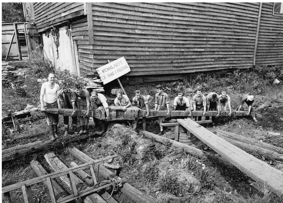
Fig. 2 Twelve strong men were needed to get the largest piece of the Big Ship keelson out of the excavation trench.

to be placed very close to the end of the ship to reach across from bollard to bollard. Placing the windlass so close to the stem would be impractical, and has no parallel in the known sources. Two bollards with sockets for a windlass were found in Bryggen. They differ in size, and must be from two different vessels. The locations of the finds are so far from the Big Ship timbers that they cannot belong to this vessel (Christensen 1985). All available evidence points to the windlass being placed in the aft of the ship (Åkerlund 1951, Lahn 1993, Crumlin-Pedersen 1991). There is also iconographic evidence indicating the same, for instance the well-known town seal of Wincelsea (Ewe 1972, pp. 78 & 210). At some point, the windlass was moved from the aft to the foredeck position we are familiar with on more recent vessels, but the date of this transition is uncertain.