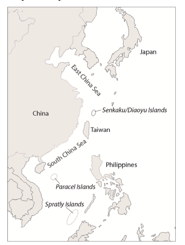
Figure 2: Map of the disputed areas in the East and South China Seas