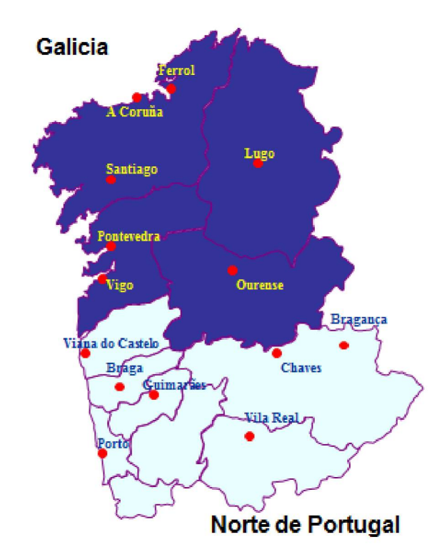
Figure 4: Map of the EGTC Galicia-Norte de Portugal