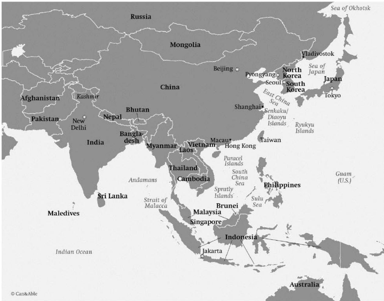
Map 1 Asia