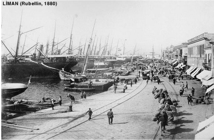
Illustration 3: Izmir Port in the Nineteenth Century.