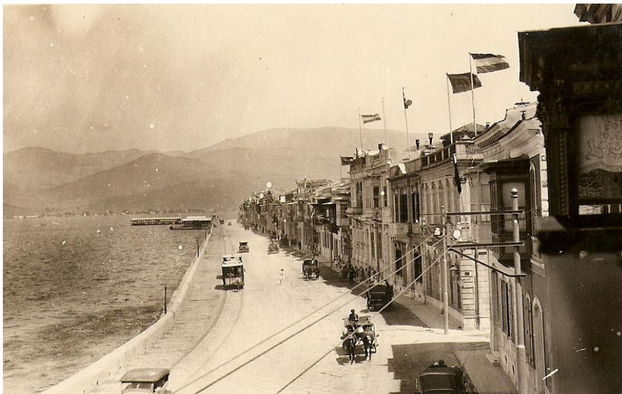
Illustration 4: Famous Esplanade (Kordon) of Izmir in the Nineteenth Century