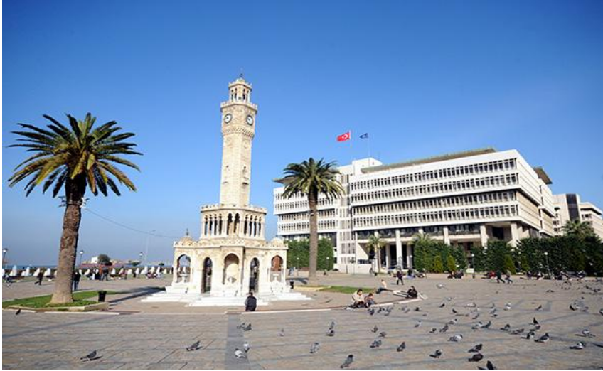
Illustration 2: Historic Clock Tower at Konak Square in the City Centre of Izmir. 49